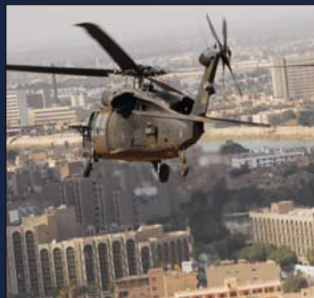
▲ A 34th Combat Aviation Brigade UH-60 Black Hawk helicopter flies over Baghdad.

The 34th Combat Aviation Brigade (34th CAB) of the 34th Red Bull Infantry Division is an aviation brigade headquartered in St. Paul. In May, more than 700 brigade Soldiers returned from deployments in Iraq and Afghanistan.