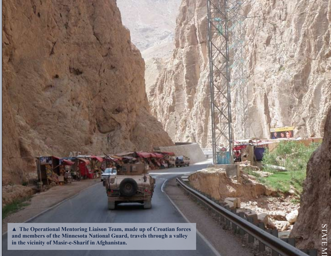
▲ The Operational Mentoring Liaison Team, made up of Croatian forces and members of the Minnesota National Guard, travels through a valley in the vicinity of Masir-e-Sharif in Afghanistan.

In November, 14 pilots from the Canadian Armed Forces trained for two weeks with Minnesota National Guard pilots from B Co., 2nd Battalion, 211th General Support Aviation Battalion. The pilots received advanced collective training on the CH-47 "Chinook" helicopters at the St. Cloud Army Aviation Support Facility with our combat-experienced Minnesota flight crews.