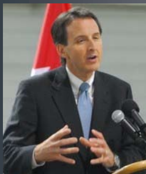
Gov. Tim Pawlenty