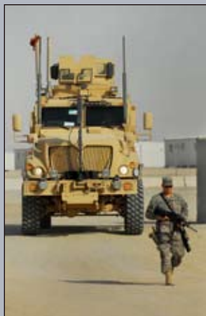
▲ The 1st Battalion, 151st Field Artillery, based in Kuwait and using the MRAP vehicle, performs convoy security operations throughout Iraq.

The Convoy Escort Teams of the 1st Battalion, 151st Field Artillery are the first Minnesota National Guard units to use Mine-Resistant, Ambush Protected (MRAP) vehicles to escort convoys. The MRAP provides increased security and protection.