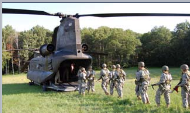
▲ 175th Regiment Soldiers board a CH-47 Chinook during a training exercise at Camp Ripley.

The 175th Regional Training Institute provides combat arms, leadership, military occupational specialty and general studies training for the Army National Guard, Army Reserve and active component Army Soldiers at Camp Ripley.