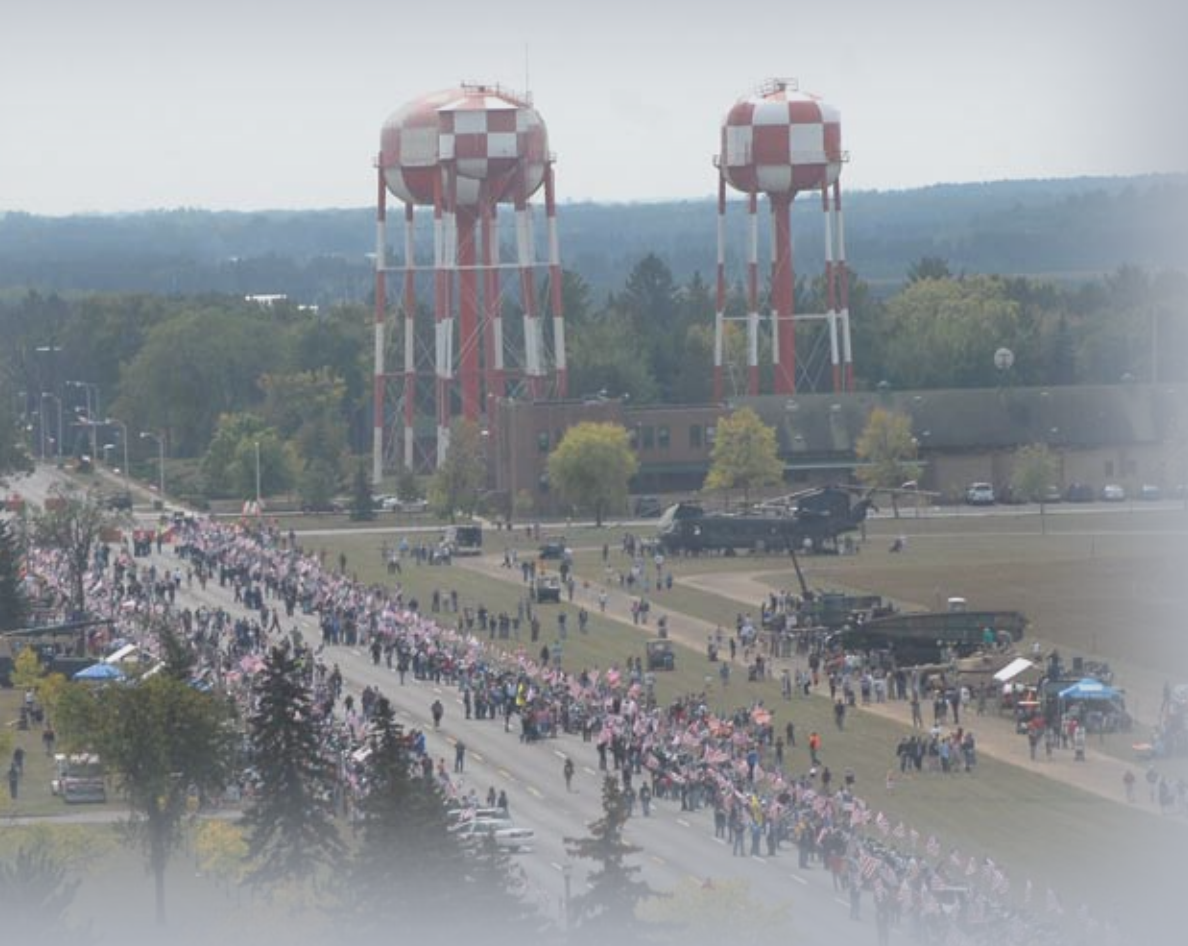
▲ The Minnesota chapter of the Patriot Guard assembled for a record flag line during the 2009 Camp Ripley Open House. More than 1,500 U.S. flags of various shapes and sizes lined both sides of Infantry Road.