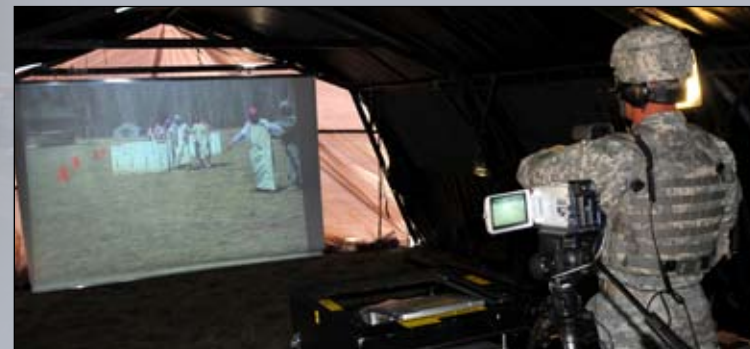
▲ In 2009, Camp Ripley received the virtual Rules of Engagement (ROE) trainer from the Norwegian Home Guard. This fully integrated training system helps Soldiers determine how force should be applied.

Minnesota state agencies also rely on Camp Ripley’s exceptional facilities for training. Community interest groups across the spectrum of Minnesota life utilize Camp Ripley for its resources, expertise and commitment to award-winning environmental stewardship.