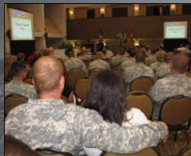
◀ Reintegration events, such as this one in Bloomington in August (above, left), provide opportunities for Servicemembers to connect with families and loved ones during the reintegration process.