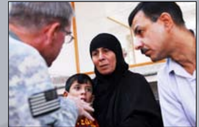
▲ 34th Infantry Division Soldiers apply their civilian-acquired skills to improve Iraqi civil capacity.

Headquartered at Contingency Operating Base Basra, the Red Bulls completed their mission during a critical period of Iraq's history by accomplishing three major objectives: First, ensuring that Iraqi Security Forces could protect their population and borders in southern Iraq; next, the Red Bulls assisted the Government of Iraq in developing civil capacity and economic well-being; and finally, the 34th Division set the conditions for a successful drawdown of U.S. forces in their area of responsibility.