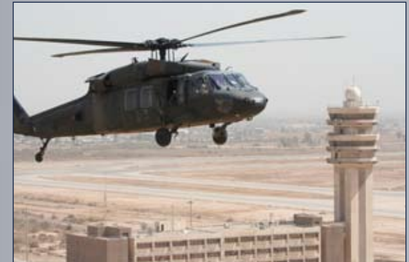
▲ The 34th Combat Aviation Brigade UH-60 Blackhawk begins a flight out of Baghdad International Airport.

While in support of 18th Airborne Corps, the 34th Combat Aviation Brigade flew more than 40,000 combat flight hours, commanded aviation units that spanned the Iraqi countryside from Mosul to Tallil, controlled assets worth $1.1 billion dollars in military equipment, and returned the aviation brigade comprised of units from 11 different states to the U.S. in May 2009.