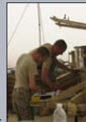
E Battery Soldiers maintain radar equipment in Iraq. ►

In April, 82 Soldiers from the Anoka-based E Battery, 151st Field Artillery deployed to the Baghdad area to provide radar support to Multi-National Corps-Iraq. The unit is responsible for sensor management, logistical and maintenance support of 15 Corps radar teams providing counter fire support and sensory capabilities to bases in Iraq.