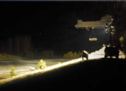
◀ Near Lake LaMoure, N.D., a Minnesota National Guard CH-47 “Chinook” helicopter emplaces 2,600-lb concrete mats into the shoreline of an emergency spillway to alleviate erosion.

O n March 21, 2009, under the direction of Governor Tim Pawlenty, the Minnesota National Guard was deployed to the Red River Valley to assist residents and local authorities with flood fighting efforts.