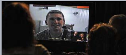
▲ A 34th Infantry Division Soldier talks with his family during a Serving Our Troops event Dec. 12.

Connecting families and communities with the deployed, Serving Our Troops is a group of St. Paul-based civic leaders who come together to support those who put themselves at risk. Since 2004, Serving Our Troops has served more than 40,000 St. Paul-style steak dinners to Minnesota National Guard members around the world. Each occasion features volunteers serving dinners to deployed Minnesota National Guard members and to their families.