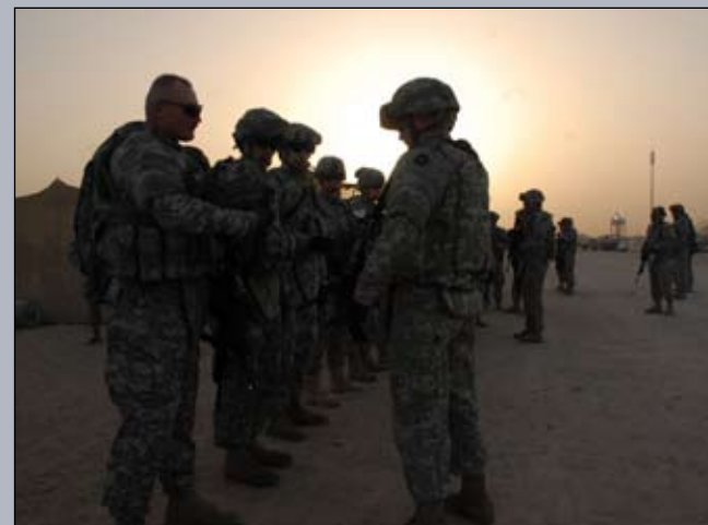
▲ The Red Bulls arrive in Kuwait in April.

trol of military forces in the southern third of Iraq. The area, known as US Division-South, is geographically about the size of Minnesota and is the largest sector in Iraq. Headquartered at Contingency