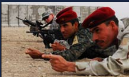
▲ The US military stopped operating in Iraqi cities on June 30 with confidence that the Iraqi Security Forces could provide security for their own population.