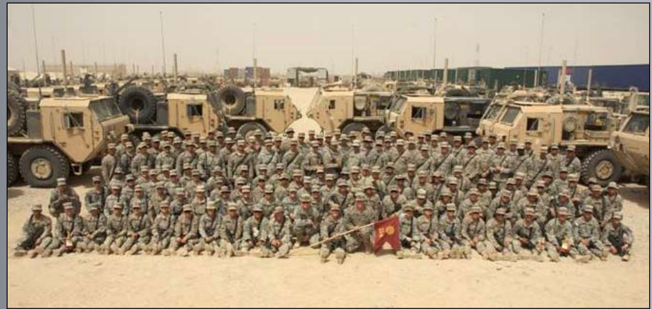
▲ The Soldiers of the 114th Transportation Company at Camp Leatherneck, Afghanistan.