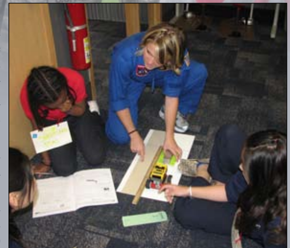
▲ A STARBASE instructor with kids at the 133rd Airlift Wing.

STARBASE was established in 1993 and operates out of the 133rd Airlift Wing near Ft. Snelling. STARBASE has earned a reputation for providing high-quality programs that have benefited over 29,000 youth.