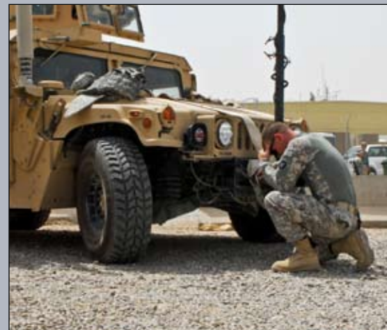
▲ A member of the 34th Military Police Company prays before moving out on a mission.

Through partnerships with Iraqi leaders and the nine Provincial Reconstruction Teams throughout US Division - South, the 34th Red Bull Infantry Division was able to improve civil capacity and economic well-being in the country.