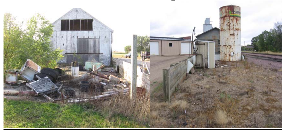
Photo: ACRRA funds are being accessed to clean-up abandoned agricultural sites such as these.