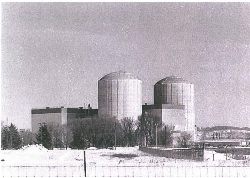
Nuclear Plant at Prairie Island, 1975