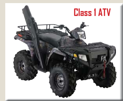
Class 1 ATV

ATVs are defined as motorized, floatation-tired vehicles of not less than three low-pressure tires, but not more than six tires. Class 1 ATVs are further defined as vehicles with engines less than 800cc and under 900 pounds. Class 2 ATVs are defined as vehicles with engines less than 800cc weighing between 900-1,500 pounds.