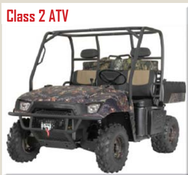
Class 2 ATV