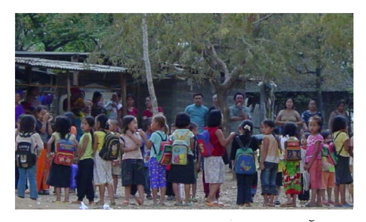
camp. The school was not supported by the government. Volunteer teachers taught students using their own curriculum and donated materials that were often times outdated.

Newcomer students are eager to learn and to take advantage of the educational opportunity that is now finally available to them. They want to take challenging and mainstream classes, but sometimes they are being placed in classes that are well above their academic and English language abilities – where they struggle, can't find support and