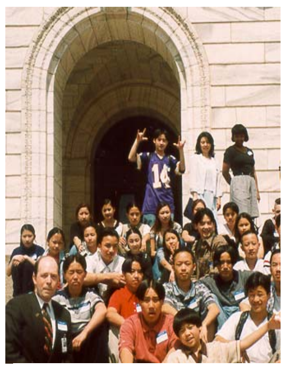
An Asian club and their advisor visits the State Capitol for Asian Pacific American Day.

Asian clubs are school sponsored extracurricular activity options available to students. The clubs have a teacher advisor