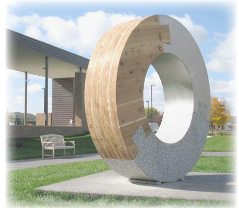
Glazer, Interconnect II