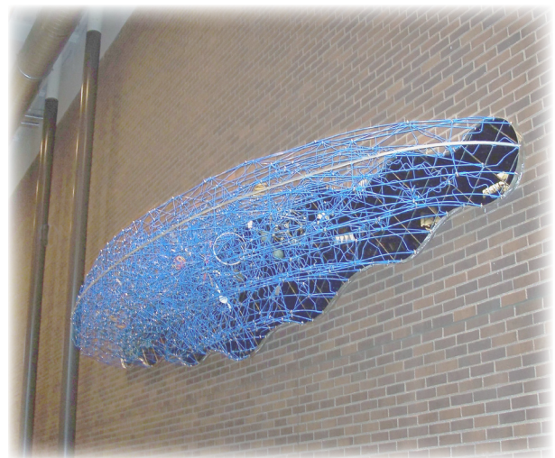
Hatcher, Gravity Wave

Artworks: Interconnect I, Interconnect II