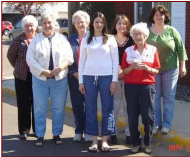
Volunteer Update held May 15, 2008

The guide, supported in part by paid advertisement offer local service providers an opportunity to financially support the well-recognized publication. Service provider listings remain free of charge as a public service of the Center.