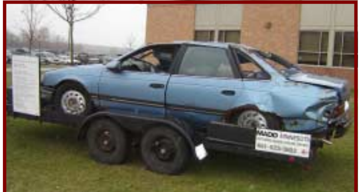
MADD Crash Car displayed at Cambridge-Isanti High School - promotion by the Safe Communities of Isanti County collaborating efforts focused on reducing crashes in Isanti County through safety education and prevention.