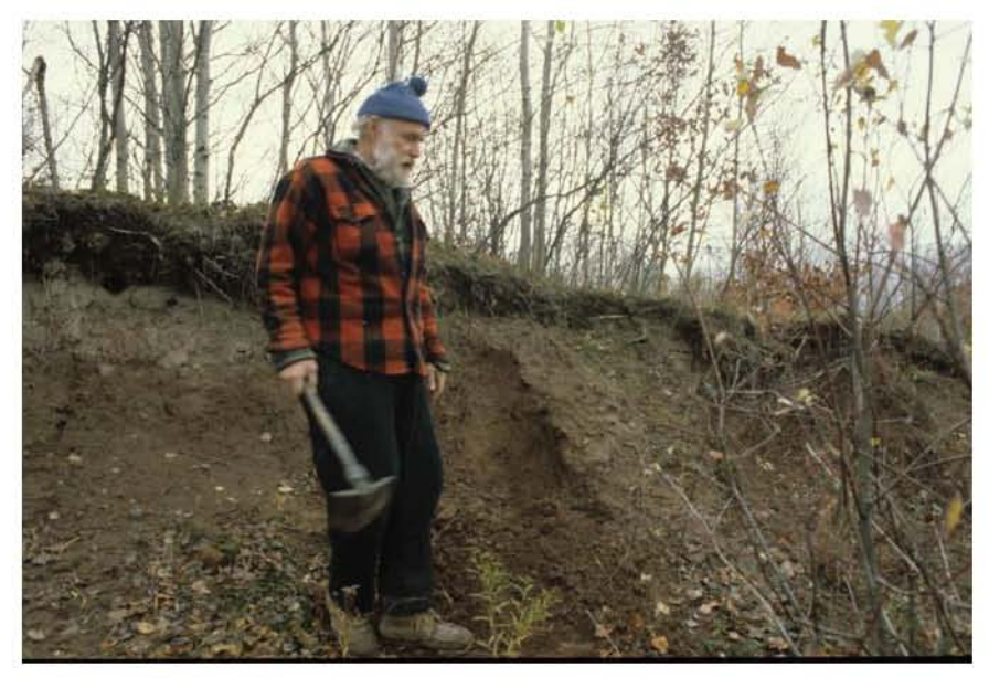
The OSA acknowledges the contributions to Minnesota archaeology of geologist and paleoecologist Herbert Wright, Jr. on the occasion of his 90<sup>th</sup> birthday.

Another method of remotely assessing mound condition utilizes recently perfected LIDAR surveys. LIDAR stands for Light Detection and Ranging. It basically is like RADAR except laser light pulses from an airplane are used instead of radio waves. Current LIDAR technology can achieve vertical elevation resolutions of six inches (15 cm) thus resulting in Digital Elevation Modules (DEMs) that show surface topography that is accurate to within a foot. Several state agencies and many Minnesota counties have already sponsored LIDAR surveys of many areas in Minnesota. Because most burial mounds in Minnesota were originally higher than one-foot and even mounds in long-cultivated areas can still be evident at this vertical resolution, a LIDAR survey could be very useful in remotely and efficiently assessing mound condition. The OSA will investigate cooperative LIDAR ventures in FY 2008 with other units of government. An LCCMR grant may even be prepared to further a mound status survey.