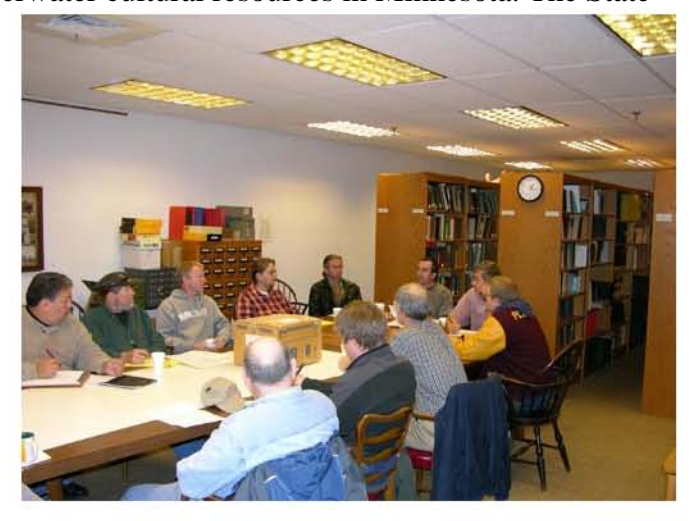
Council for Minnesota Archaeology (CMA) meeting at Ft. Snelling.

The State Archaeologist presented a talk on the archaeology of the Minneapolis riverfront to the People's University at the Minneapolis Public