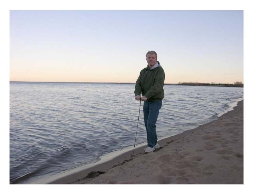
State Archaeologist Scott Anfinson probing for the wreck of the USS Essex on Park Point in Duluth in 2007.