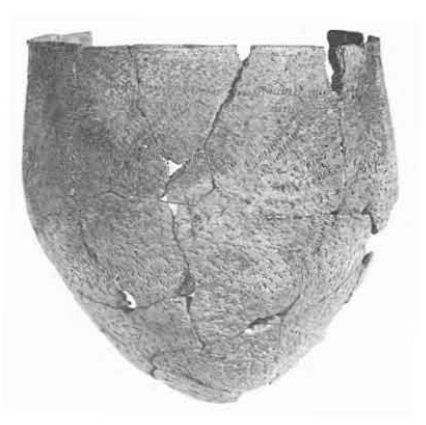
A Brainerd vessel from 21CA37.

to help define the chronological limits of Brainerd Ware ceramics. Elden Johnson first defined Brainerd ceramics following excavations at the Gull Lake Dam site (21CA37). They were originally thought to date between AD 600 – 800, but more recent radiocarbon dates from charred material on Brainerd sherds have suggested that Brainerd may be as old as 1400 BC. This would make Brainerd ceramics some of the oldest in North America. However, there is some evidence that dates taken from pot scrapings may date older than they should due to carbonate contamination. An OSA initiative in 2008 may seek to shed light on the age of Brainerd ceramics and the carbonate contamination question.