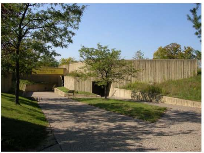
The Ft. Snelling Visitor's Center as viewed from the east.

Furthermore, because MHS houses the State Historic Preservation Office (SHPO), it has an obligation to not only preserve historic buildings, but to set an example for their re-use. Thus if the existing Visitor's Center at Ft. Snelling cannot be rehabilitated, the second option should be to rehabilitate the adjacent historic structures both as a Visitor's Center and as an archaeological facility. The costs for either of these options should be lower than that of a new facility. They are also more "green" options.