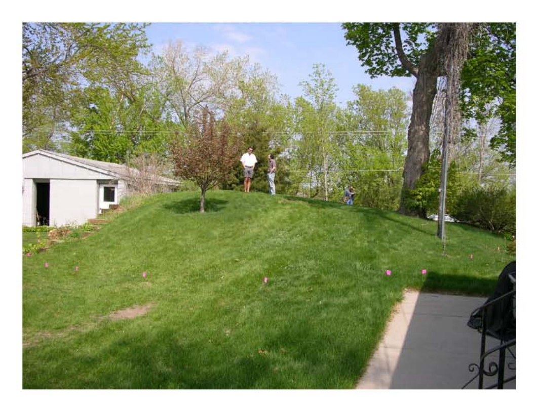
A burial mound on Lake Minnetonka with a garage built into the side.