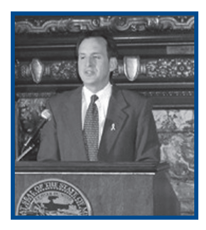
Governor Tim Pawlenty announces introduction of the Mental Health Initiative of 2006 at a press conference at the State Capitol on February 24, 2006.

The Minnesota State Advisory Council on Mental Health (Council) is comprised of 30 members mandated by state and federal law. Members of the Council are appointed by the Governor, and include present or former consumers of mental health services, family members, providers, state and county elected officials, advocates, state department representatives, social service directors and others. The state law also mandates the Council to have a Subcommittee on Children's Mental Health (Subcommittee), which includes parents of children with emotional disturbances, providers, advocates, state department representatives, state and county elected officials, county social service directors and others. Minnesota Statute 245.697 Subd. 3. requires the Council to file a formal report with the governor and legislature each even-numbered year.