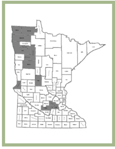
Counties where small hive beetle was detected