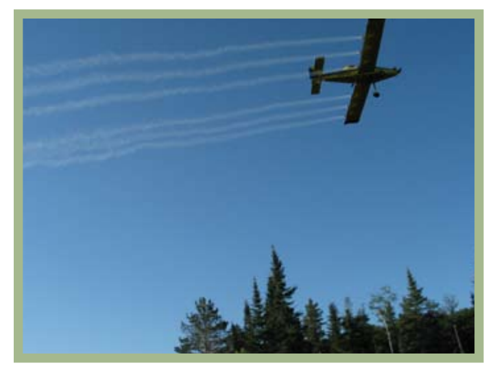
2005 gypsy moth treatment

The Invasive Species unit is focusing on its mission of keeping invasive species out of Minnesota. An evaluation of the program has exposed several program needs, including a database to track reports of pests, periodic updating of compliance agreements and development of a process under the new statute (Minn. Stat. Chapt. 18G and 18J, 2003) for enforcement. The unit is also experiencing a shortage in funding for response efforts. We are discussing license surcharges to fund an Invasive Species Emergency Response Fund to address costs incurred for control of invasive species new to Minnesota. The surcharge would be applied to certain MDA licenses, certifications and registrations that are related to plant health.