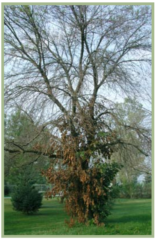
Emerald ash borer damage in Detroit