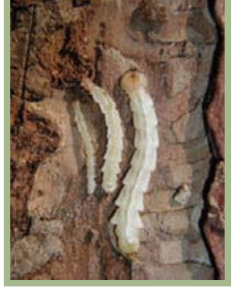
Emerald ash borer larvae

The MDA, in cooperation with the USDA Forest Service (FS), began the development of pest risk assessments to evaluate potential new invasive species threats to Minnesota's agriculture, natural resources and urban environments. The assessment process involves identifying the likelihood of introduction, establishment, spread and economic impact potential to the state. The risk assessments provide science-based evaluations for regulatory decisions, and will be used to identify and prioritize pest entry pathways