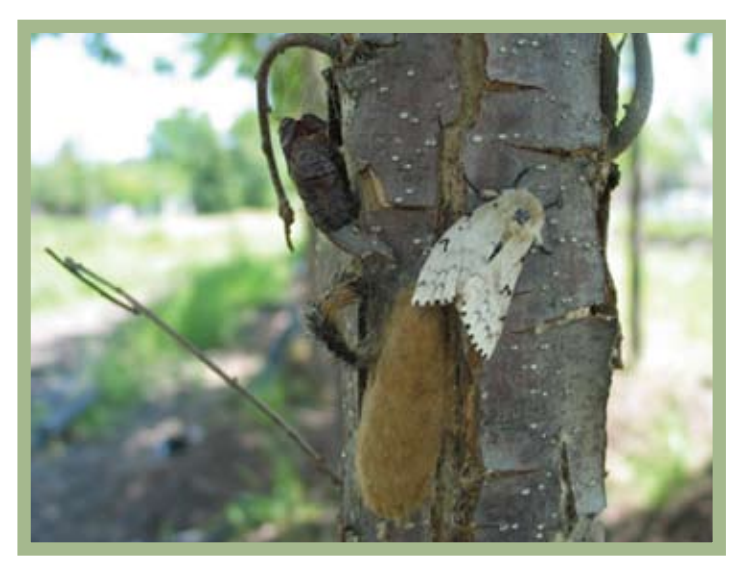
Gypsy moth life stages

In response to the record number of gypsy moths caught in northern Minnesota in 2005, the MDA has proposed to use mating disruption for treatment in the spring of 2006, achieved by applications of plastic flakes embedded with pheromone. An Environmental Assessment is being completed to identify issues related to the proposed action in the project area. Potential collaborators will be contacted early in 2006 about the findings.