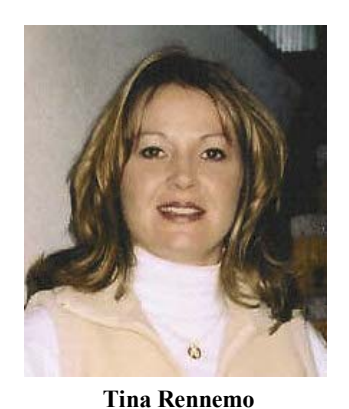
City Administrator "The City of Kelliher is very excited about receipt of this RBEG grant. Thanks to the efforts of HRDC and NMF staff we were able to assemble a successful proposal and will now have capital available to provide financial assistance to new and expanding business enterprises

"The Lake of the Woods community has identified Economic Development as one of our strategic issues through our community planning process. The HRDC is helping us develop an Economic Development plan that will focus our resources on development activities that will make a difference in our local economic quality of life."