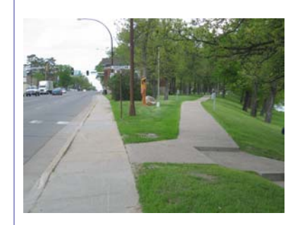
Demand for motorized and nonmotorized trails throughout the region is increasing, as are local communities' efforts to design, fund and build multi-user trail systems.