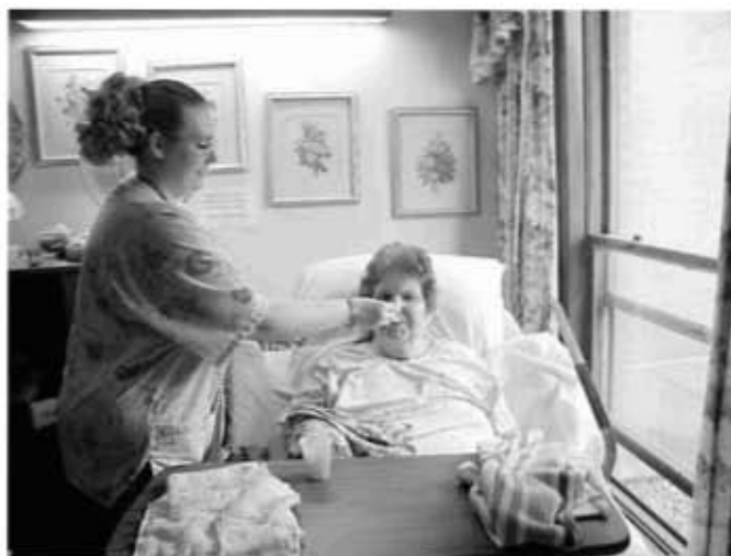
Inspection teams must observe how nursing home staff administer medication to residents.

classified at the highest level of severity, even if most of the evidence corresponds to a lower level of severity. 14 For example, in one facility a newly admitted resident, previously hospitalized for knee surgery, had to wait two hours before receiving pain medication. The nursing staff could not find the medication the resident had been receiving in its emergency kit and staff