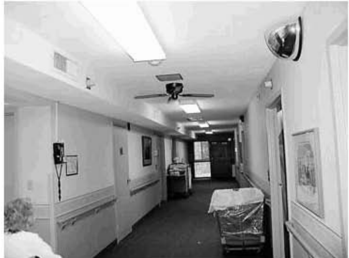
To help prevent accidents, nursing homes must keep corridors free from obstructions.

In a few cases, inspection teams cited the wrong regulation in writing the inspection report, used the same incident to issue two mutually-exclusive deficiencies, or made some other error in completing the inspection report. For example, an inspection team cited one facility for placing a wet food processor lid under a plastic cover and for having a number of baking sheets and pans darkened with food debris. Instead of citing the facility for not preparing, distributing, and serving food under sanitary conditions, the facility was cited for failing to obtain food from sources approved or considered satisfactory by state, federal, or local authorities.