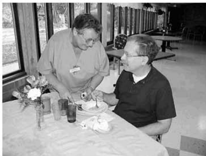
Nursing homes must provide services to residents in a dignified manner.

Quality of life deficiencies, which made up 9 percent of the deficiencies issued to nursing homes in their most recent inspections, are related to the physical comfort and psychological well being of residents. They include violations such as the failure to treat residents with dignity, accommodate reasonable resident preferences, have an ongoing activities program, and provide a safe and comfortable environment.