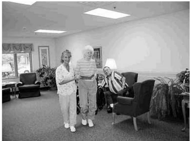
Nursing home residents generally need help with many activities of daily living.

The federal government and states share responsibility for ensuring that nursing homes provide an acceptable level of care to residents. The Centers for Medicare and Medicaid Services (CMS) in the U. S. Department of Health and Human Services oversees the inspection program for nursing homes that participate in the