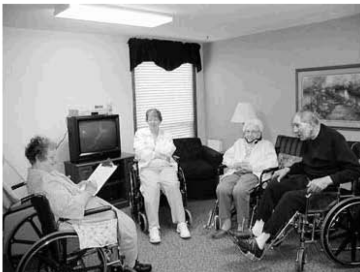
Nursing home inspectors must meet with each facility's resident council.

For the year ending September 30, 2004, MDH inspectors, working in teams of three to five registered nurses, spent an average of about 150 hours per facility to complete the state and federally mandated inspection tasks. 12 As would be expected, it took longer to inspect larger nursing homes than smaller ones. For example, a facility with 40 or fewer beds averaged about 72 hours per inspection while a facility with 116 to 160 beds averaged 176 hours. 13