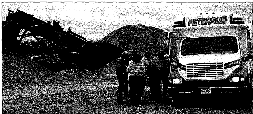
Kandiyohi County Aggregate Task Force members take a bus tour of area mining operations.

The completed ordinance was adopted by the County Board with minimal disapproval from the public or the industry.