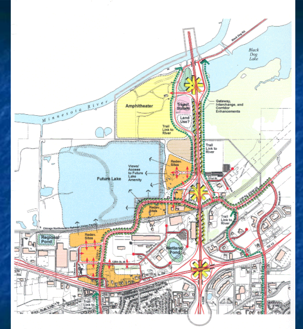
Figure 12 Recommended Gateway Area Framework Plan