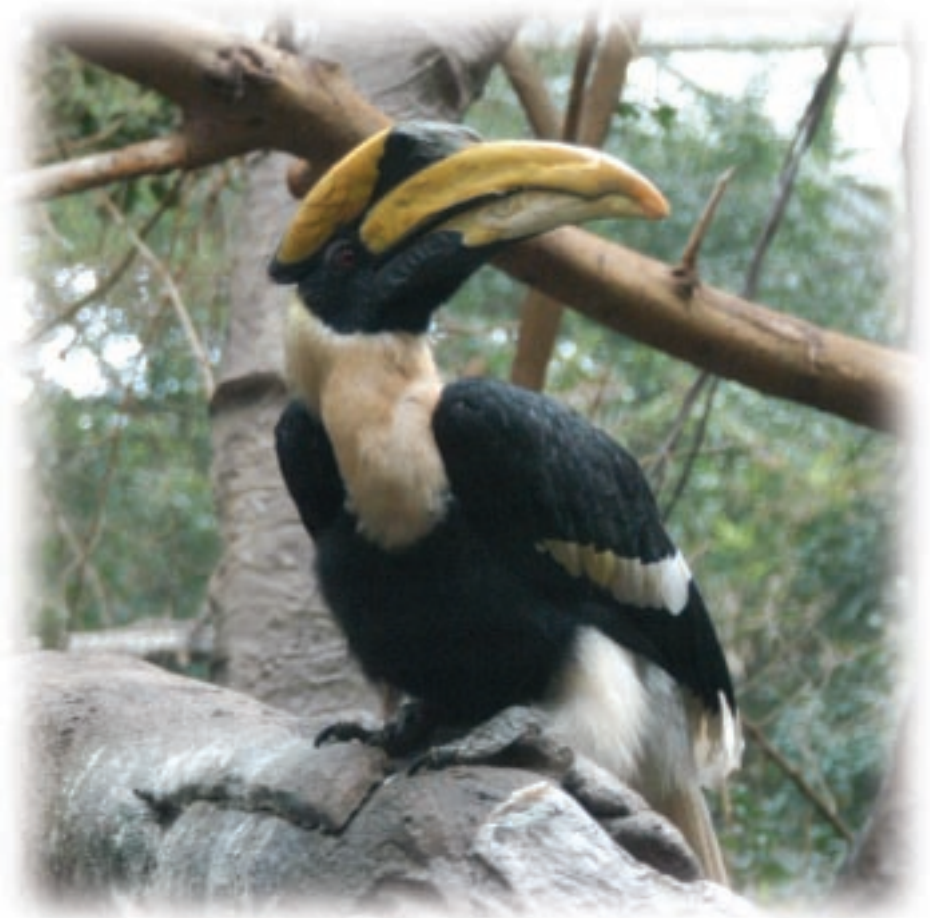
Great Indian hornbill