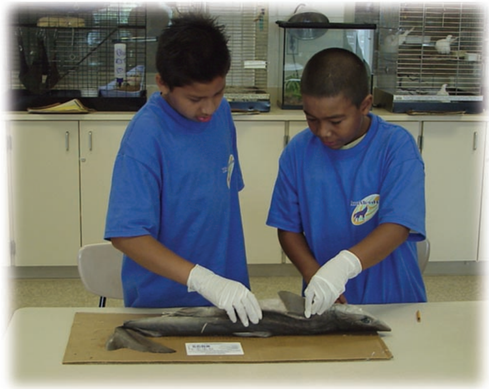
The Mentor Program, supported by the Medtronic Foundation, continued its mission of encouraging inner-city youth to experience and consider science-based careers at the Zoo. Over 100 students from Minneapolis and Saint Paul participated.