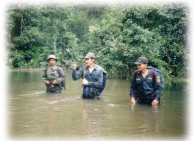
Tiger Protection Units comprised of park rangers, new recruits to the program and staff of the Sumatran Tiger Conservation Program on antipoaching patrol.

A tiger that got a little close to an infrared cameratrap used by the Sumatran Tiger Conservation Program to monitor wild tigers in Bukit Tigapuluh National Park, Sumatra, Indonesia.