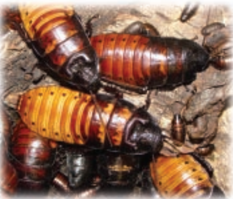
Madagascar hissing cockroach

• At the center of the new exhibit is a giant, sculpted baobab tree—a keystone to the dry land ecosystems of Madagascar. The baobab is large enough for guests to walk through and is home to some of the smaller species of the island: hissing cockroach, spiny tenrec and Standing's day gecko.