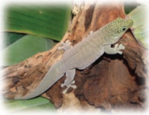
Standing's day gecko

*Not a complete listing of all new animals.