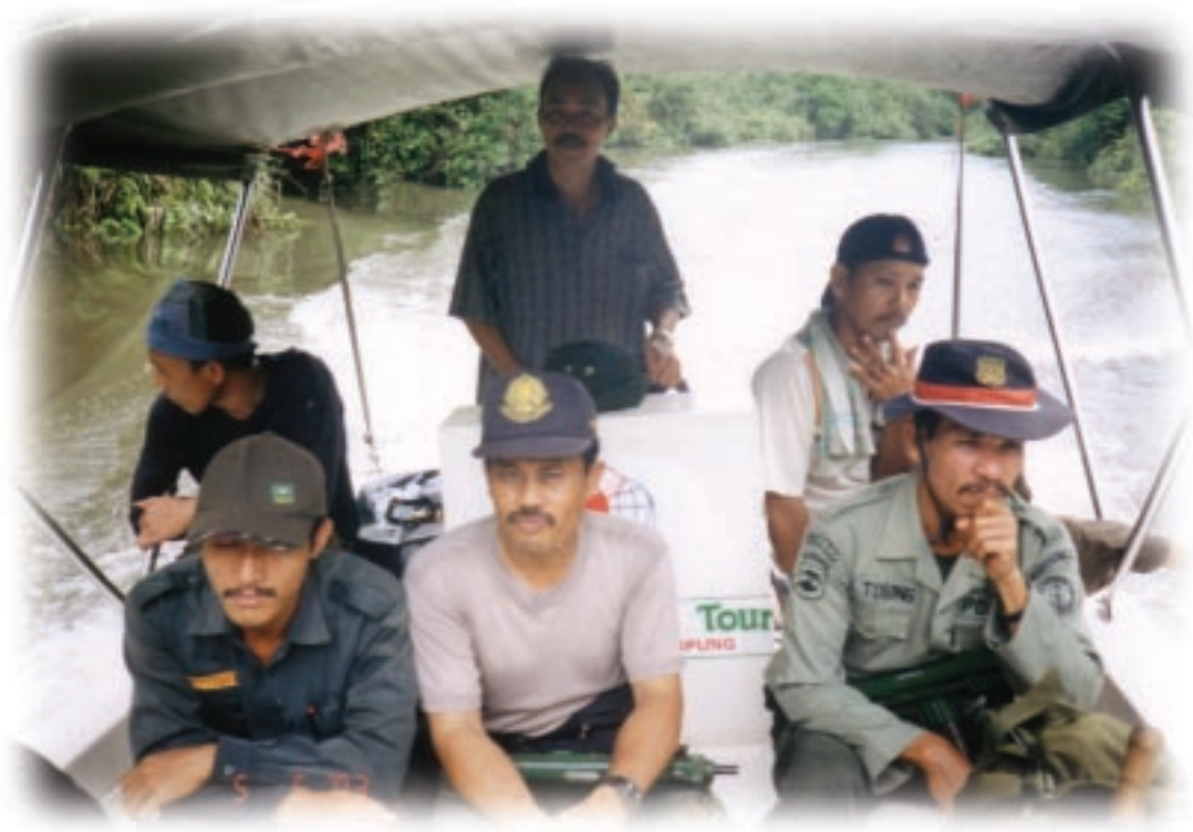
Forest rangers of Way Kambas National Park along with staff of the Sumatran Tiger Conservation Program on antipoaching patrol (pictured left).