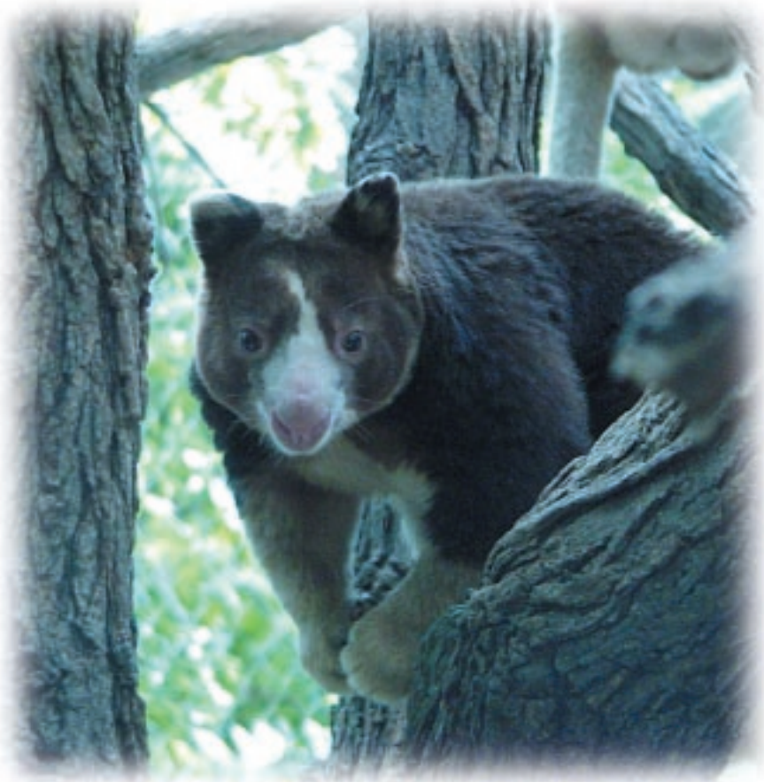
Matschie's tree kangaroo