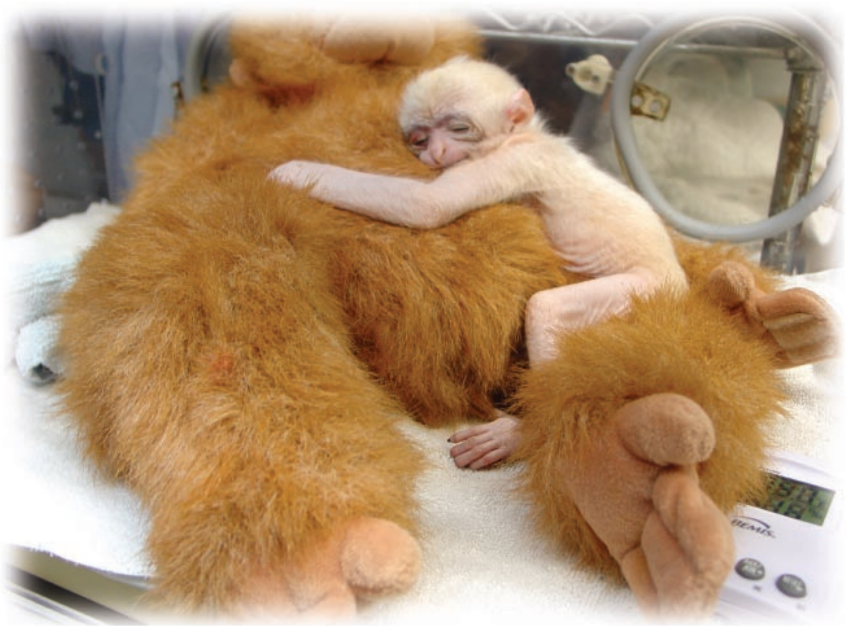
On April 16, a male white-cheeked gibbon was born at the Minnesota Zoo, which participates in the White-Cheeked Gibbon Species Survival Plan. While the "first-time" mother rejected the infant gibbon, Zoo staff devoted many hours to hand-raise him (shown above with a plush toy—his surrogate mother).