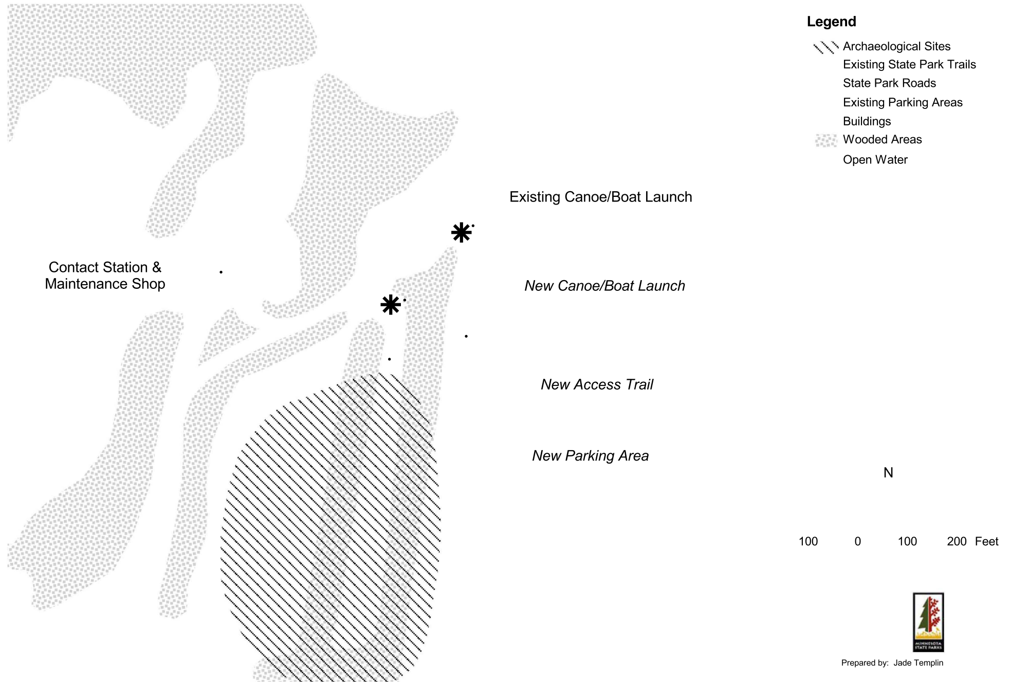
Figure 5 - Canoe/Boat Launch Relocation