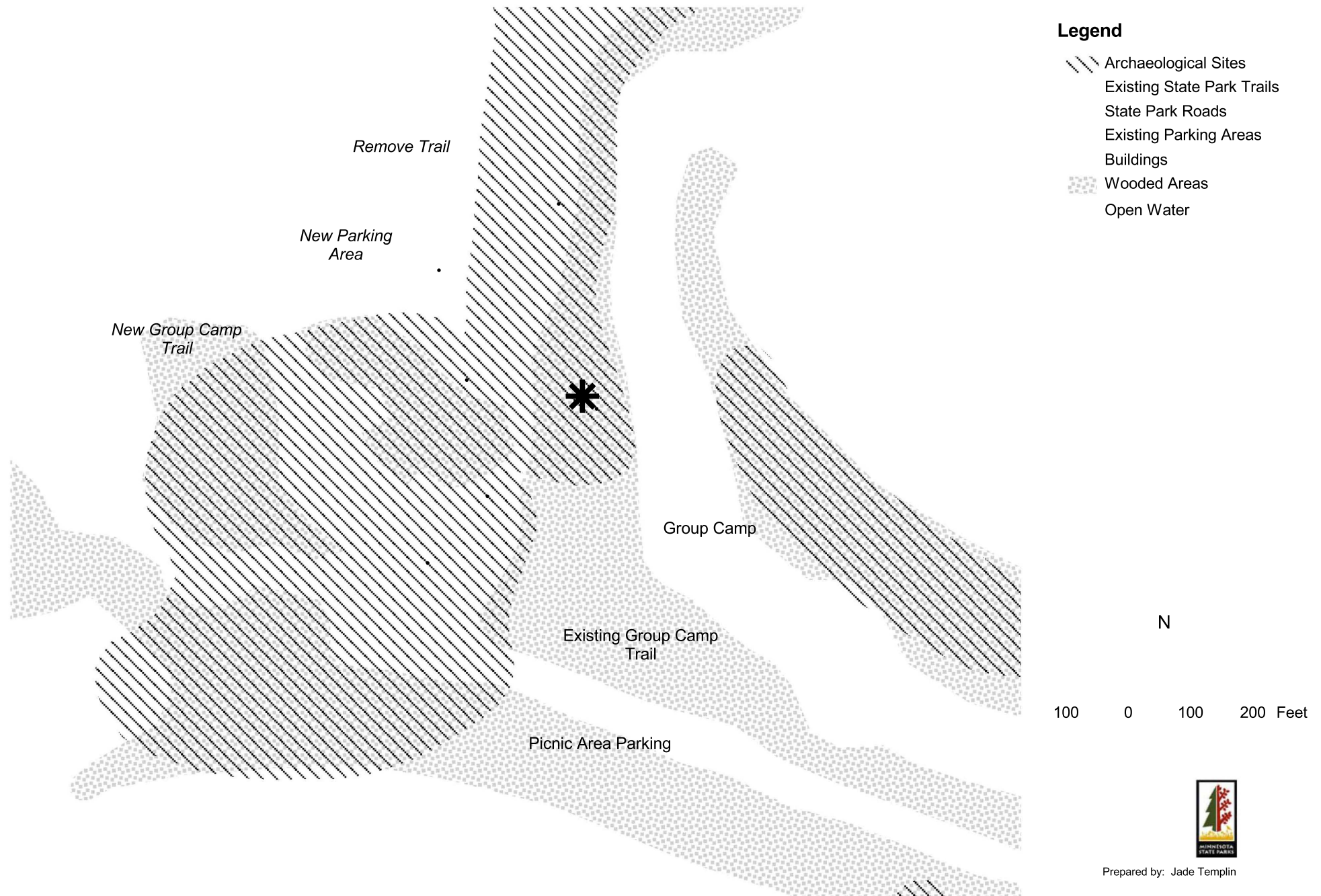
Figure 4 - Group Camp Improvements