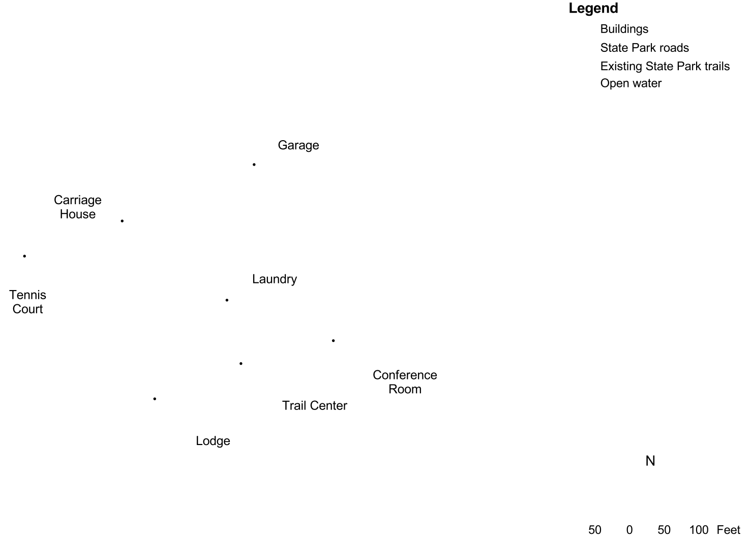
Figure 2 - Old Camp Existing Conditions