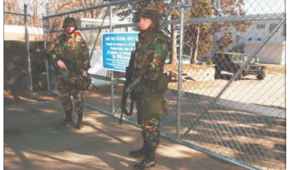
DUOTE DU TOLL CLINE

State and local government employees in the military reserves will receive a salary differential payment when called to active duty under a new law. Another law provides that Minnesota National Guard soldiers and airmen will indefinitely receive reimbursement of their college tuition and the cost of books at current rates.