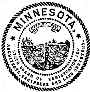
FAC-SIMILE OF THE OFFICIAL SEAL OF THE BOARD