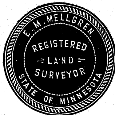
FAC-SIMILE OF REGISTRANT'S SEAL