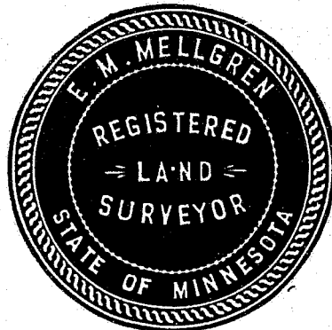
FAC-SIMILE OF REGISTRANT'S SEAL