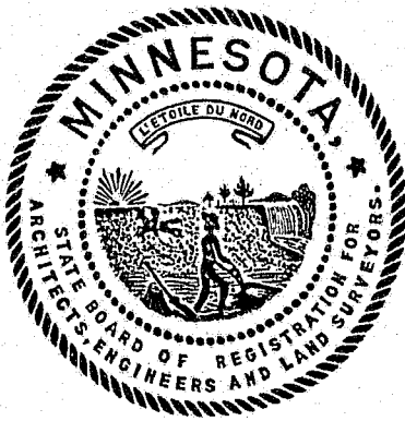
FAC-SIMILE OF THE OFFICIAL SEAL OF THE BOARD