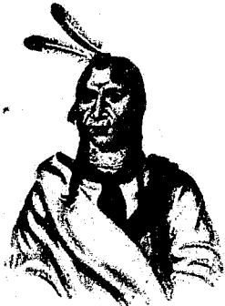
ISH-TAK-HA-BA Chief Sleepy Eye