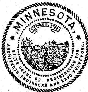
FAC-SIMILE OF THE OFFICIAL SEAL OF THE BOARD.