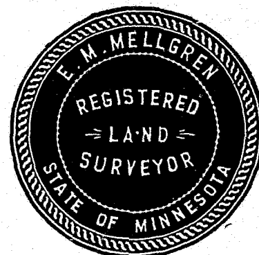
FAC-SIMILE OF REGISTRANT'S SEAL.