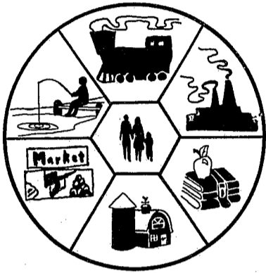
Wheel of Progress