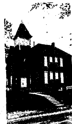
LESUEUR COUNTY HISTORICAL SOCIETY MUSEUM