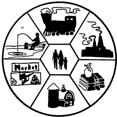
Wheel of Progress