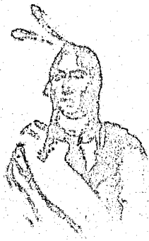
ISH-CAR-NA-BA Chief Sleepy Eye