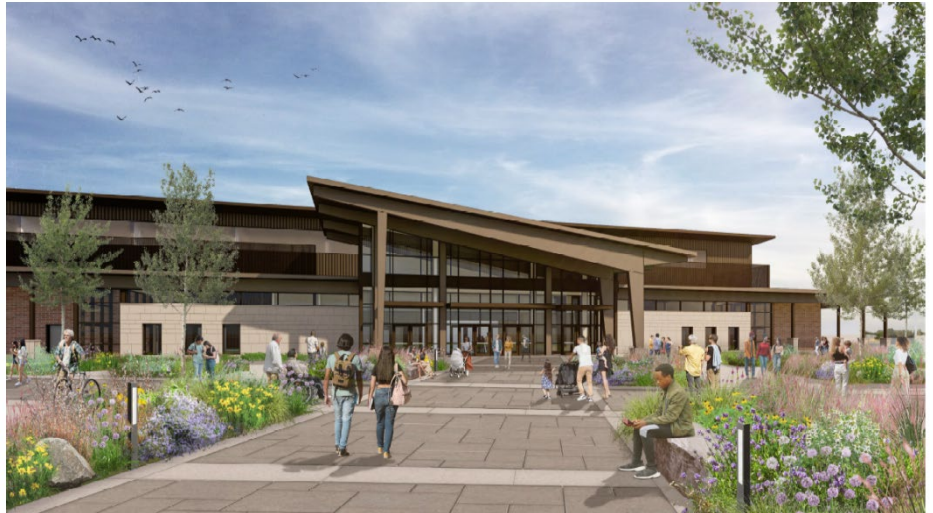
Rendering of Graham Park Regional Exhibition Center and outdoor site improvements.

Olmsted County requests a state sales tax exemption for construction materials, supplies, and equipment needed to construct the Graham Park Regional Exhibition Center and connected outdoor site improvements. The project will provide communities in the region more space for events and entertainment, bring in new tourists, and boost the regional economy.