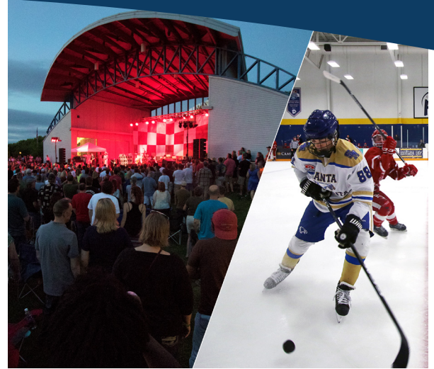
Plymouth infrastructure serves thousands of visitors. A tax exemption would reduce the financial impact to Plymouth residents for regionally beneficial projects.

A tax exemption will have far-reaching benefits – helping satisfy regional demand for amenities and mitigating the tax impact on Plymouth residents to fund regionally significant public infrastructure.