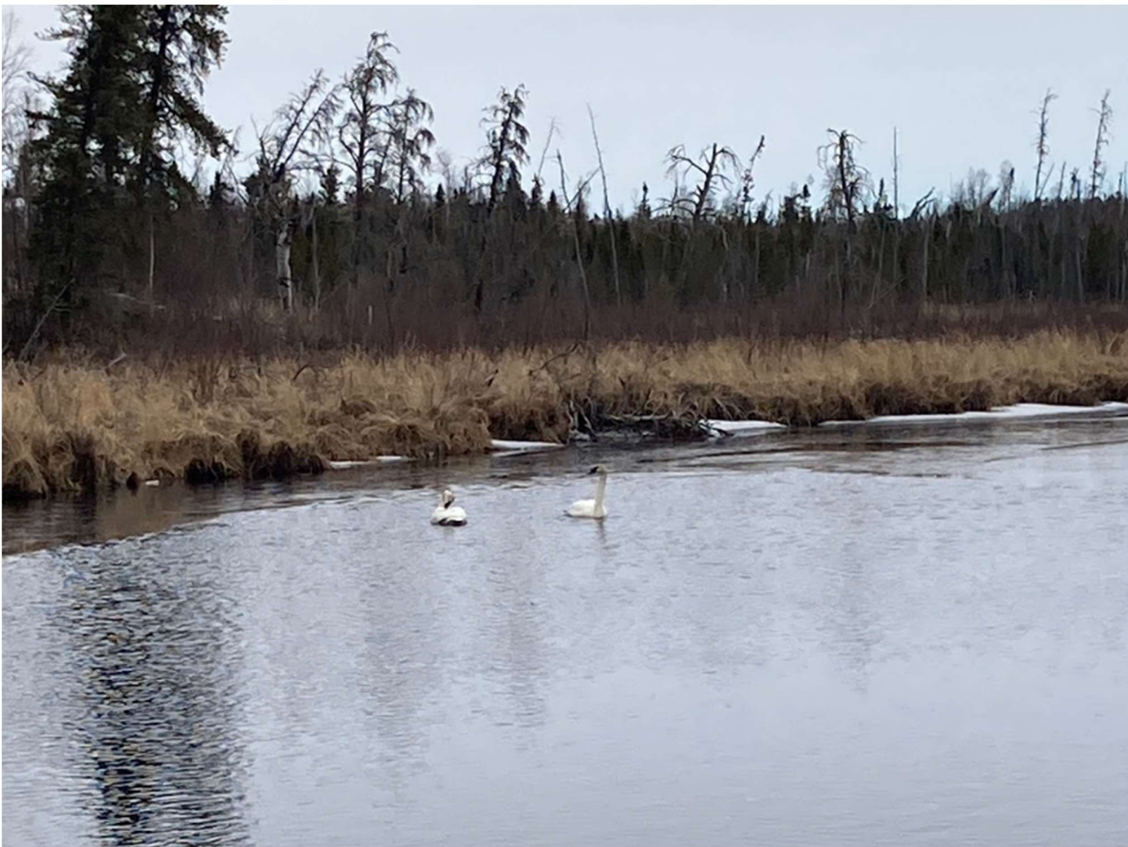
Wildlife on Range River Pond Potentially Disturbed by ATV Use of Proposed Prospector Trail