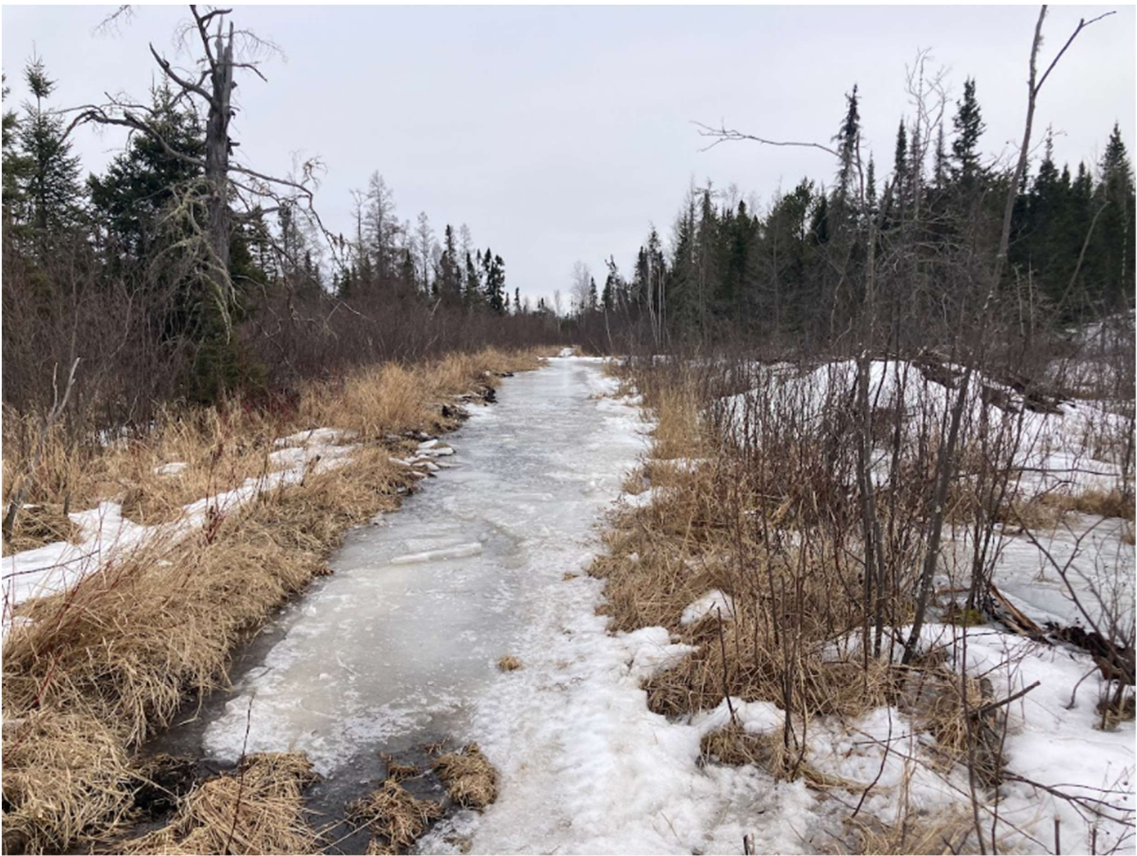
Proposed Prospector ATV Trail through Beaver Flowage with 200' wide Beaver dam on Old Railroad Grade