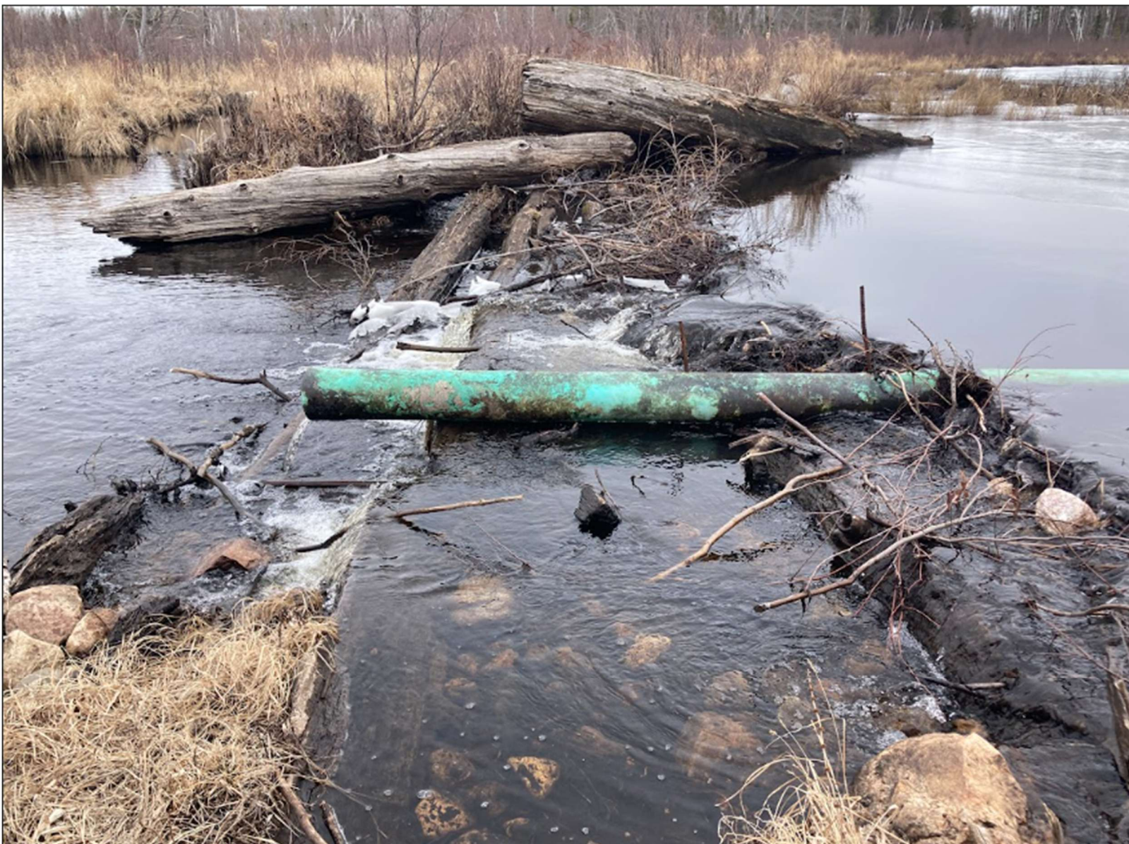
Close-up Photo of Abandoned Logging Railroad Crossing Showing Boulder and Log Cribbing on Range River