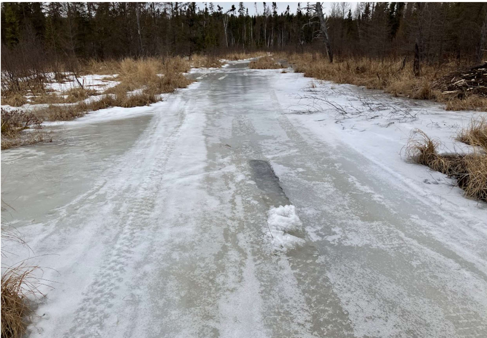
Proposed Prospector ATV Route on Flooded RR Grade Approaching Range River Crossing Showing Wetland Damage by Recent ATV Use