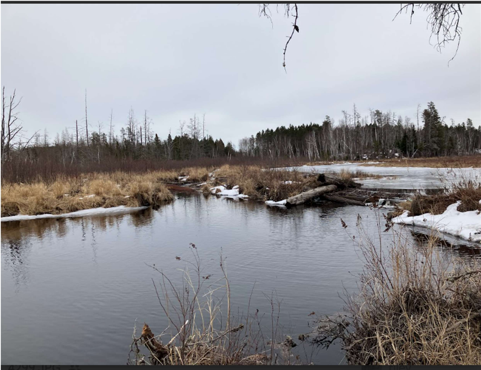
Propose Range River ATV Bridge Crossing Site for Prospector ATV Trail – 650' Width from High Ground on West to High Ground on East Side of River