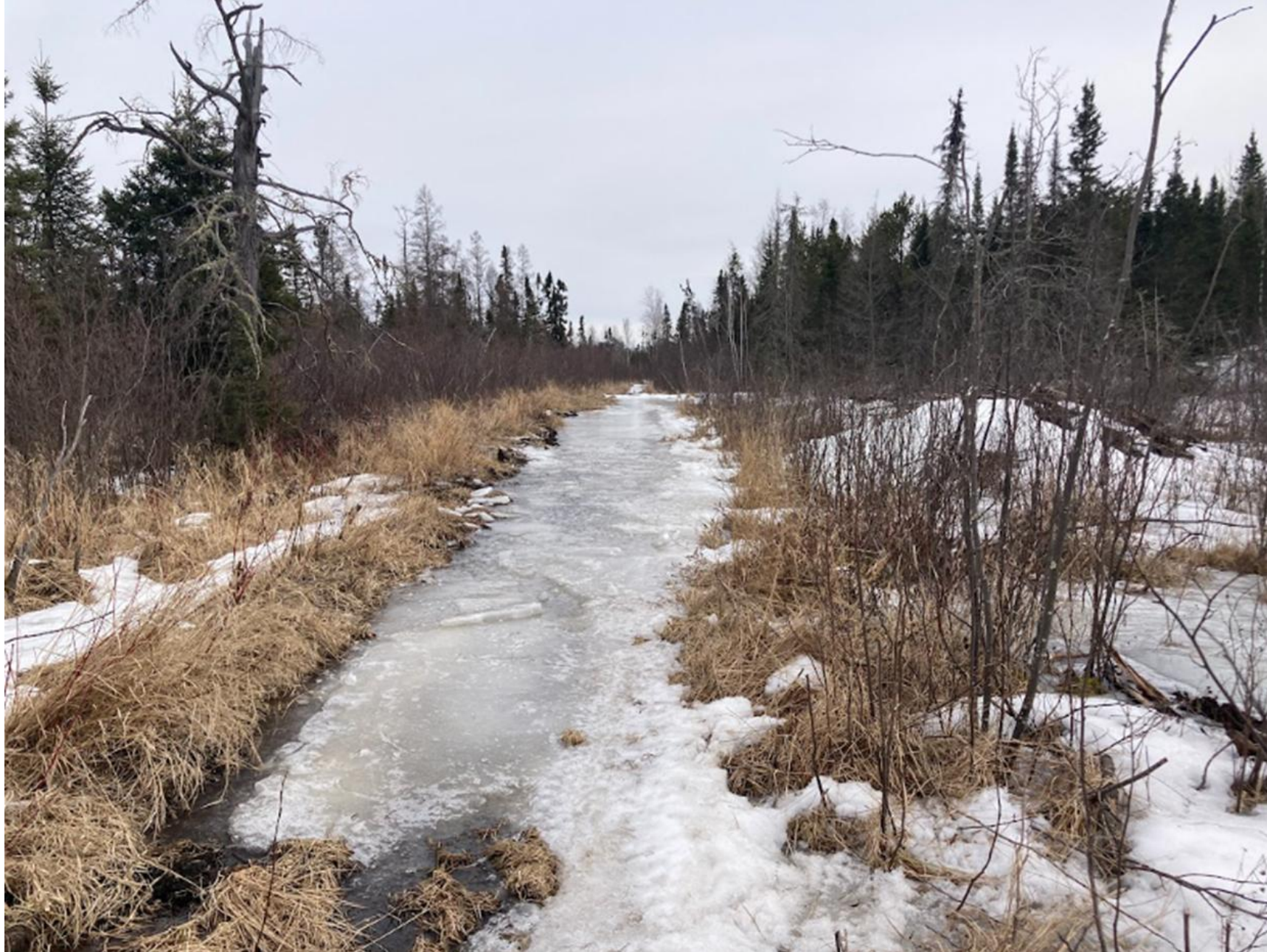
Proposed Prospector ATV Trail through Beaver Flowage with 200' wide Beaver dam on Old Railroad Grade