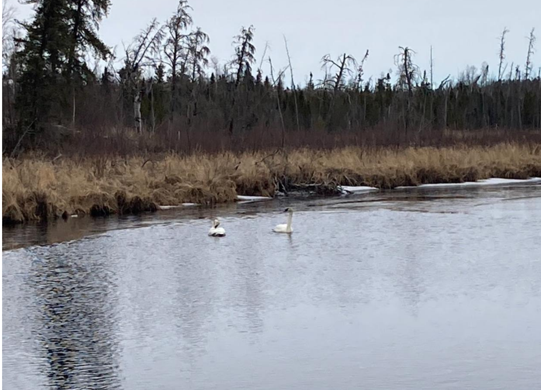
Wildlife on Range River Pond Potentially Disturbed by ATV Use of Proposed Prospector Trail