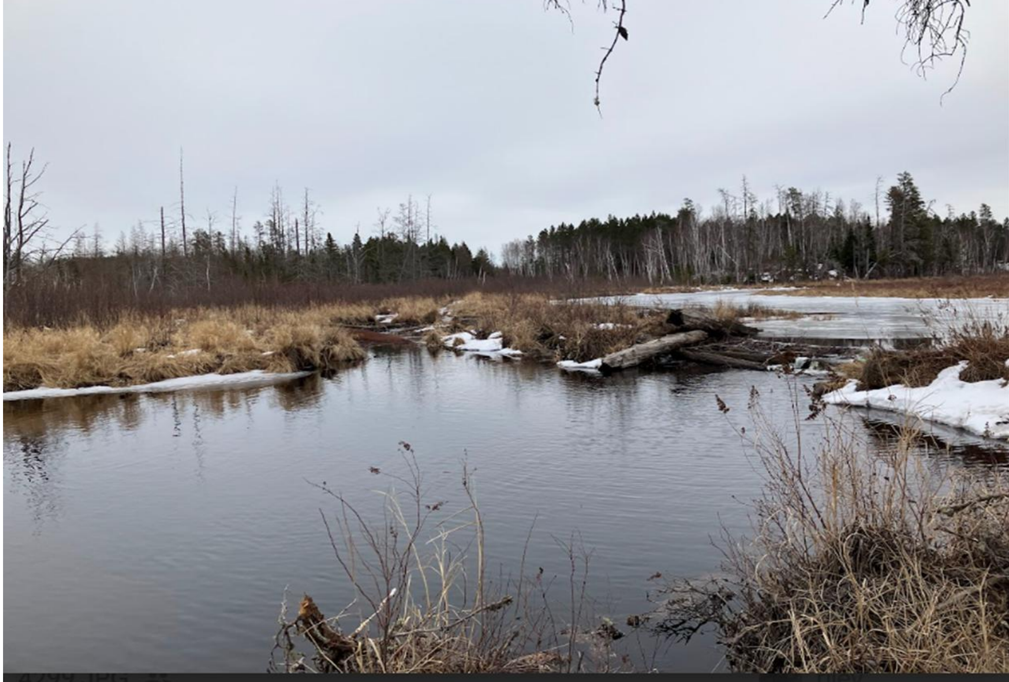
Propose Range River ATV Bridge Crossing Site for Prospector ATV Trail