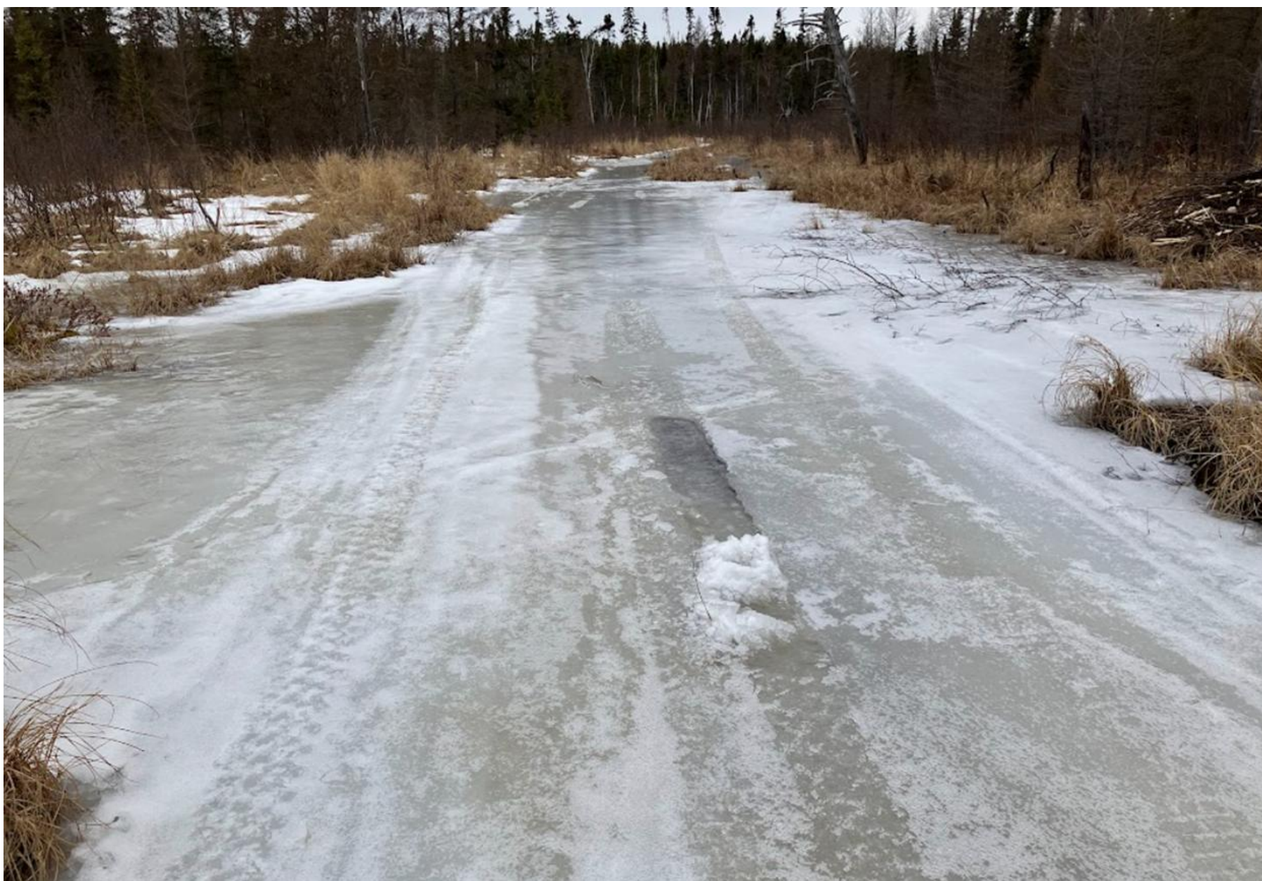
Proposed Prospector ATV Route on Flooded RR Grade Approaching Range River Crossing Showing Wetland Damage by Recent ATV Use