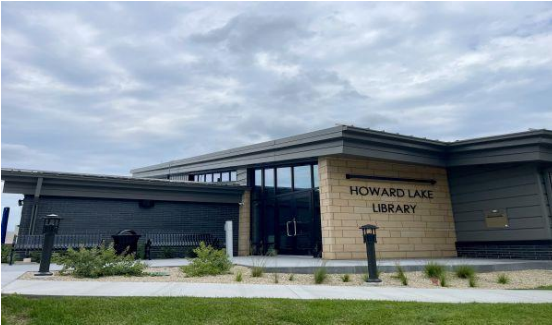
Howard Lake Library, 2020 grantee