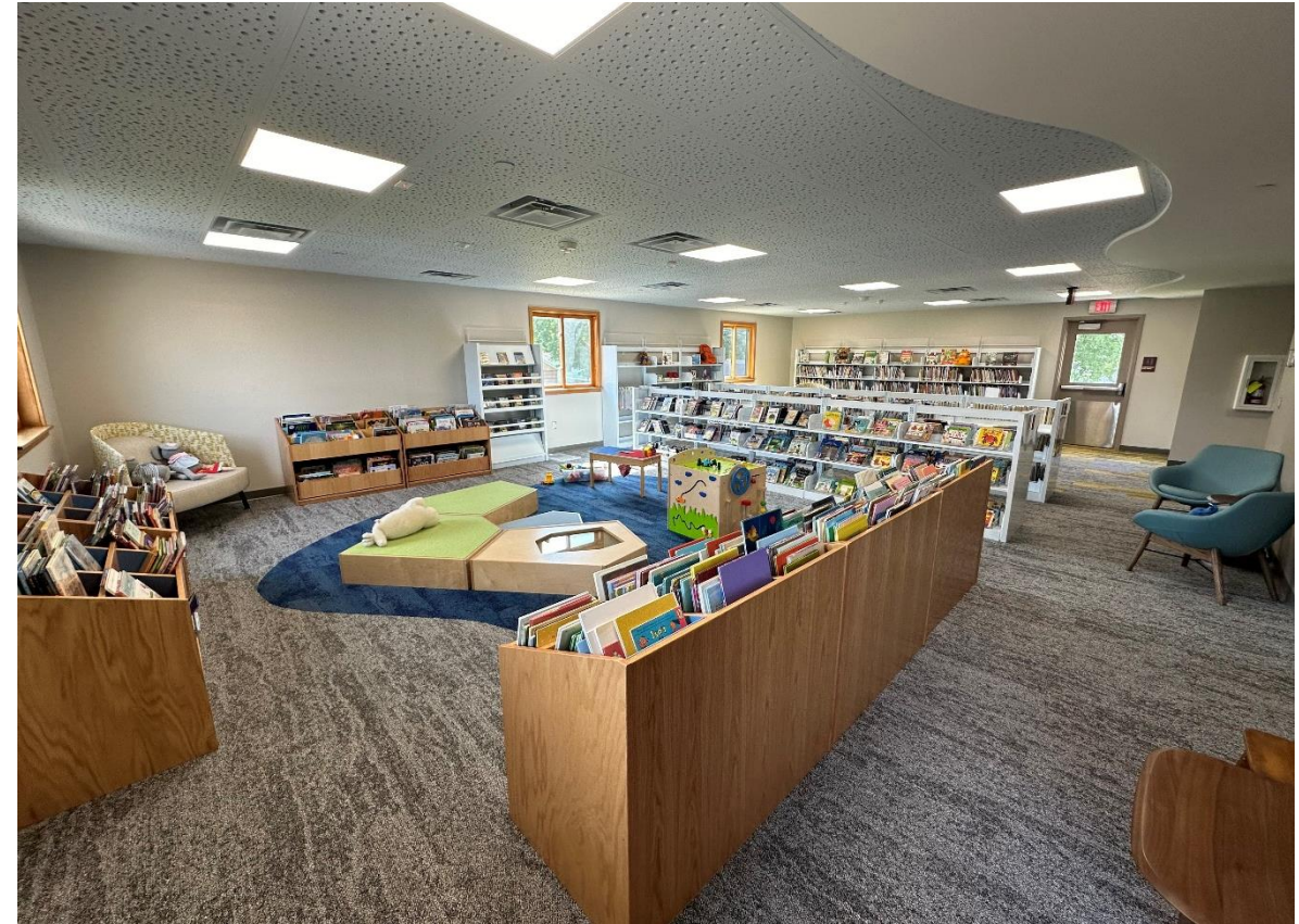
Sandstone Public Library, 2020 grantee