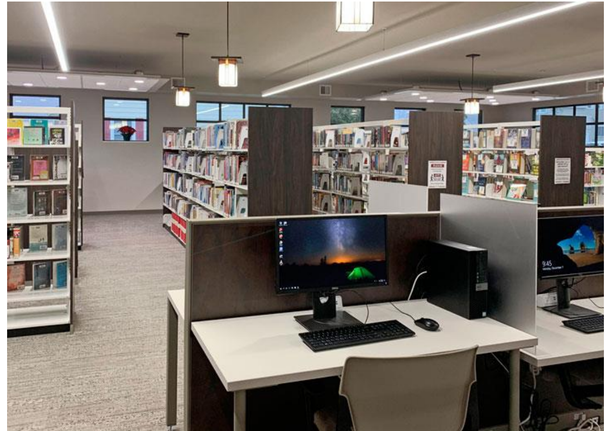
Kimball Public Library, 2019 grantee