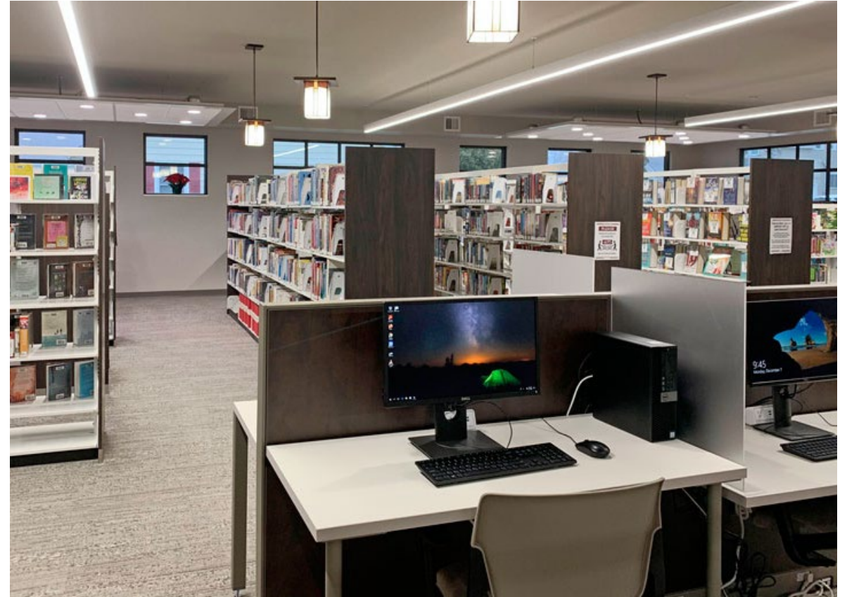
Kimball Public Library, 2019 grantee