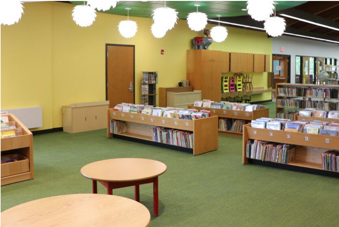
Cloquet Public Library, 2019 grantee