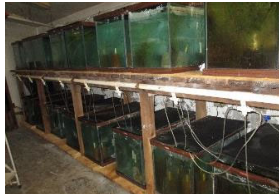
Life Support Systems