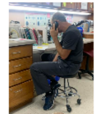
AN ARTICLE BY THE LEADER STAFF FOR THE LEADER IN BLUE EARTH, MINN. SEP 22, 2023 10:00AM

BY THE LEADER STAFF FOR THE LEADER IN BLUE EARTH, MINN. SEP 22, 2023 10:00AM