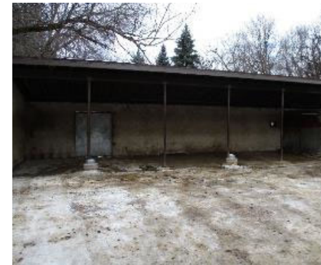
Animal Holding Areas