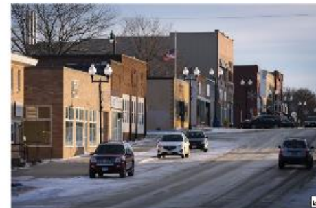
A winter scene in downtown Blue Earth, in the bottom tier of counties along the Iowa border in south-central Minnesota.

By Editorial Board Star Tribune JULY 1, 2023 — 6:00PM