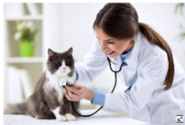
Postcard with veterinarian doctor at vet clinic.