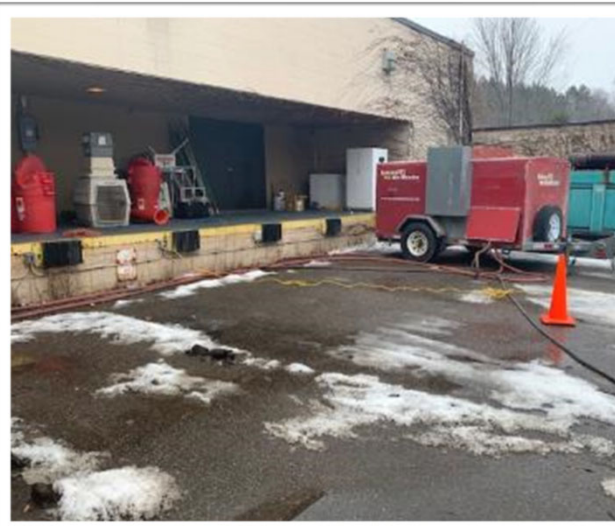
Unloading Dock serves as “ambulatory garage”