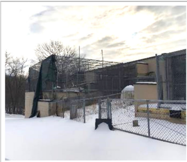
Dilapidated Animal Holding