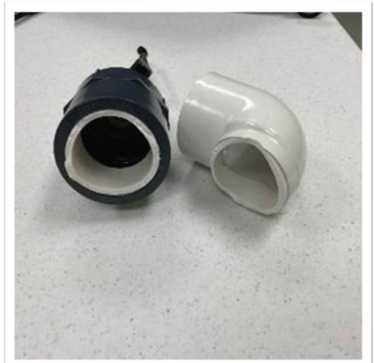
Critical System Failures