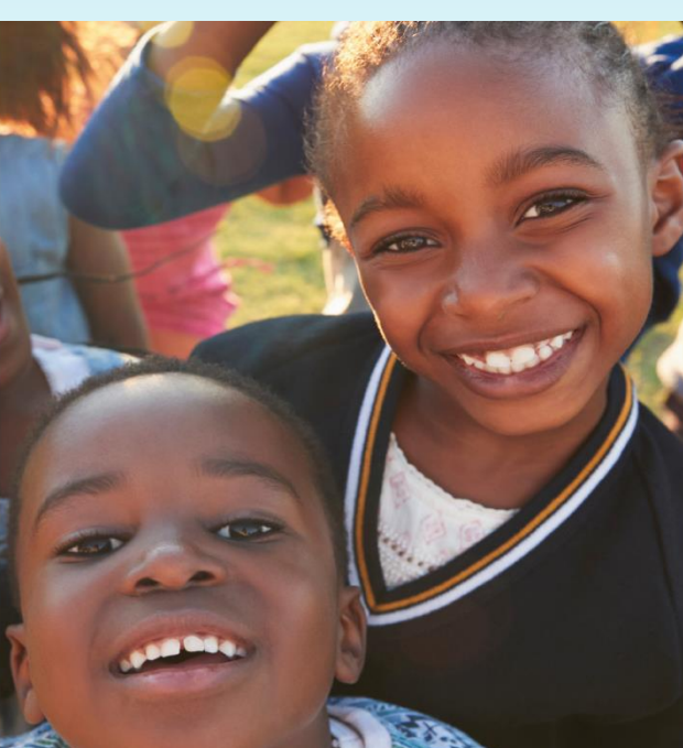
March 24, 2023 — Senate Judiciary and Public Safety Presentation by leaders from the Children's Cabinet and the Department of Public Safety