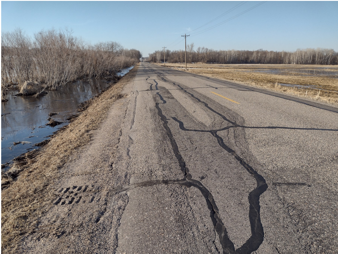
A poor subgrade and unforgiving roadside create dangerous driving conditions.