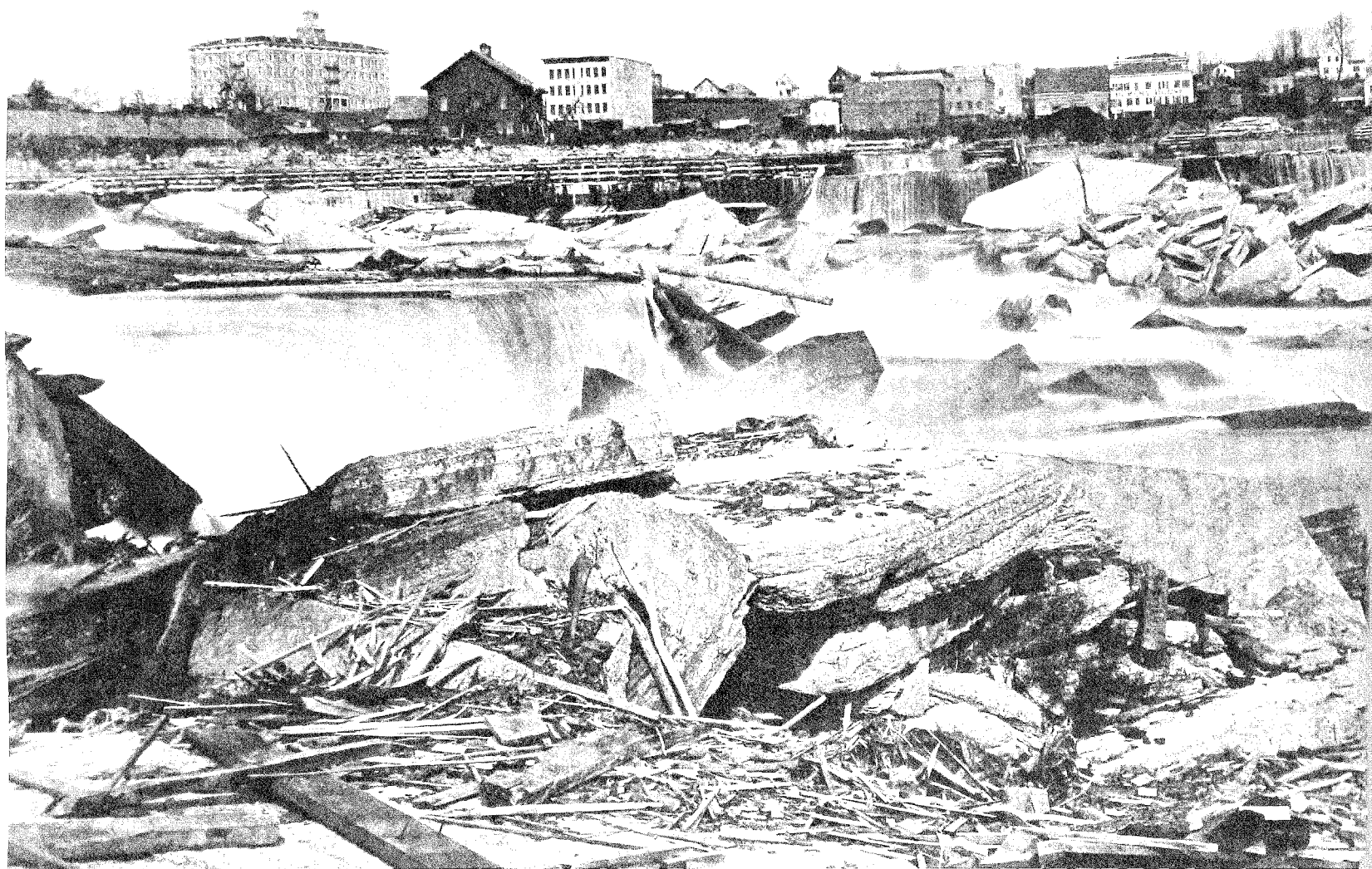
The Falls of St. Anthony gave Minnesota great industrial potential, and by 1863 mills flanked these Mississippi River falls.

No one doubted that the lumber industry needed elbowroom. The industry itched for the pine in Lake Superior country. The federal government accommodated by tempting the Chippewa with offers of payments and trading credits in exchange for