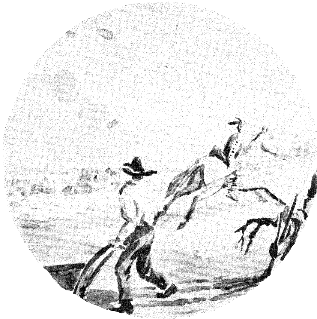
Against a distant background of Minnehaha Falls, an Indian brave on a horse is seen turning away from a settler who has cut into the soil with his plow and into a tree with his ax. Seth Eastman, an Army captain stationed at Fort Snelling, submitted this watercolor in 1849 as the basis for the Minnesota State Seal.

sota farmers. In the 1850s, almost everyone believed that farmlands were the key to Minnesota's long-term economic solvency.