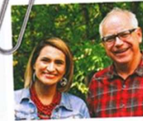
Tim Walz & Peggy Flanagan

Fully and equitably funding our schools and supporting Universal Pre-K for Minnesota kids?