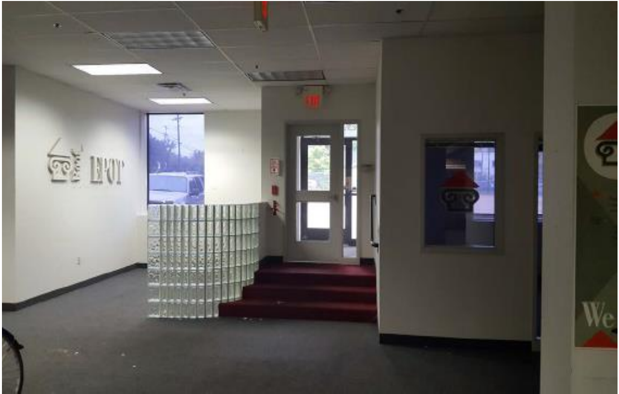
Interior office and retail space

The following pictures were taken shortly after discovering that the site was for sale during the only tour of the building allowed us. Before its sale, the Owners completely renovated the warehouse spending over a million dollars on a new roof, new double and triple pane windows throughout, new insulation and an updated heating plant.