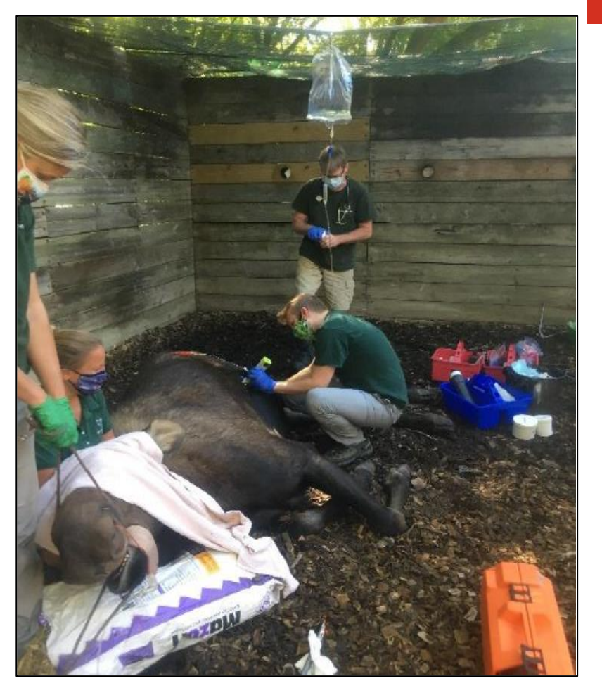
Moose procedure happening in Moose holding