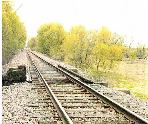
Union Pacific railroad track near future pedestrian overpass