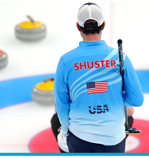
Left: UMD Men's Hockey team National Champions, photo courtesy of B105. Right: John Schuster, 2018 Olympic Gold Medalist and 2022 Olympian, seen on a curling ice sheet, photo courtesy of Getty Images.

The investment in creation of the DECC has enabled other state and regional institutions, most notably UMD, to forgo investments in similar facilities, avoiding duplication and additional capital expenditures. The DECC delivers the best in the arts, entertainment, sports, commerce, tourism and events to the region and the state!