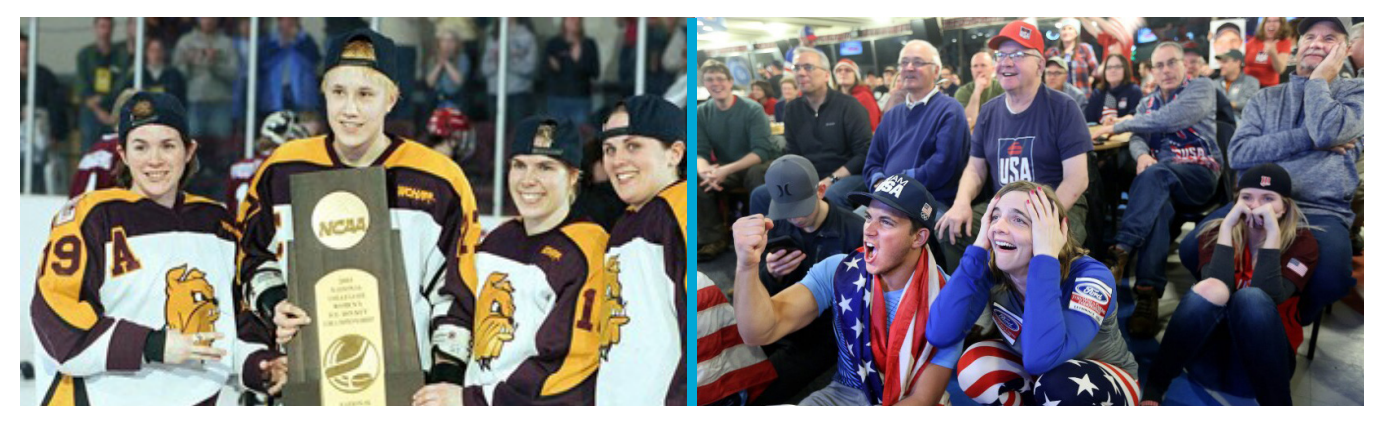
Left: UMD Women's Hockey National Champions, Right: Fans cheer on the US Men's Olympic Curling Team during a watch party at the Duluth Curling Club in the DECC

In 2021 there was an ammonia leak in the aging cooling system of the DECC. This created a very dangerous situation which, thankfully, the DECC engineers and the Duluth Fire Department we were able manage without any injuries. This incident forced leadership to review and evaluate the overall safety of the facility, identifying many areas of life safety concern, and drive investments to these repairs rather than expansion or new facilities.