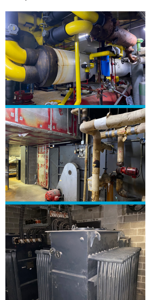
Top: ice chiller plant, middle: air handling unit, bottom: electric transformer.

The Duluth Entertainment Convention Center contains over 980,000 square feet built in 1966 and was the first convention center facility in Minnesota. The DECC was constructed as two large facilities, the Auditorium and the Arena, with a connection between the two buildings. Today, both spaces remain as premier facilities. Little alteration has happened over the last 60 years. This mid-century modern facility is now an historic space, with a uniqueness in design, but utilities and operating infrastructures are past their prime.