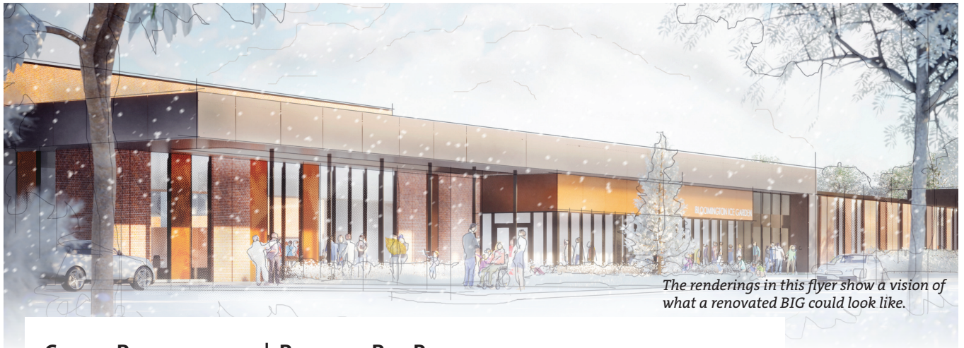
The renderings in this flyer show a vision of what a renovated BIG could look like.