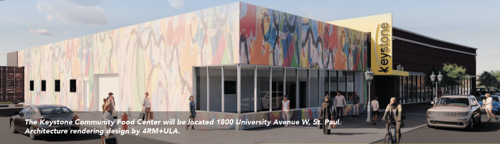
The Keystone Community Food Center will be located 1800 University Avenue W, St. Paul. Architecture rendering design by 4RM+ULA.

Your investment will provide food security for years to come.