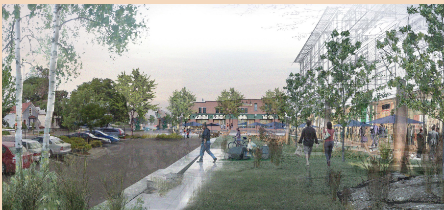
First look at the rendering for the new space and building

Join NACC in our efforts to combat inequitable healthcare and housing for Native American families