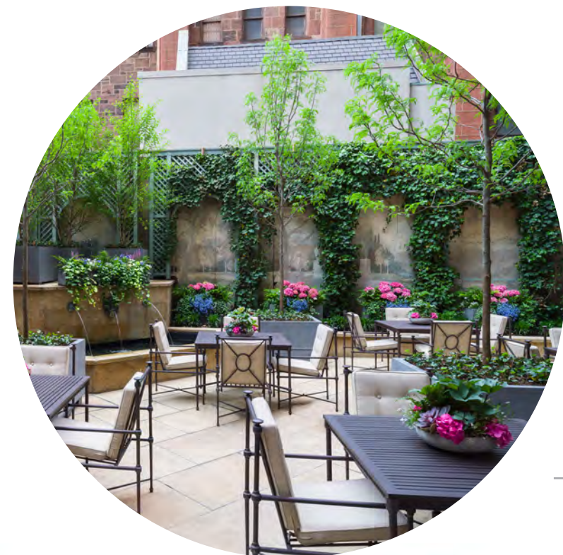
RESTAURANT PATIO SPACE EXAMPLES