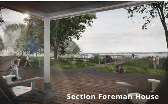
Section Foreman House