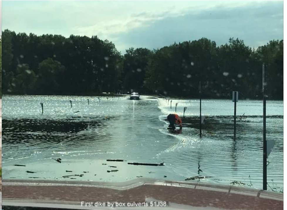
First dike by box culverts 51J38.