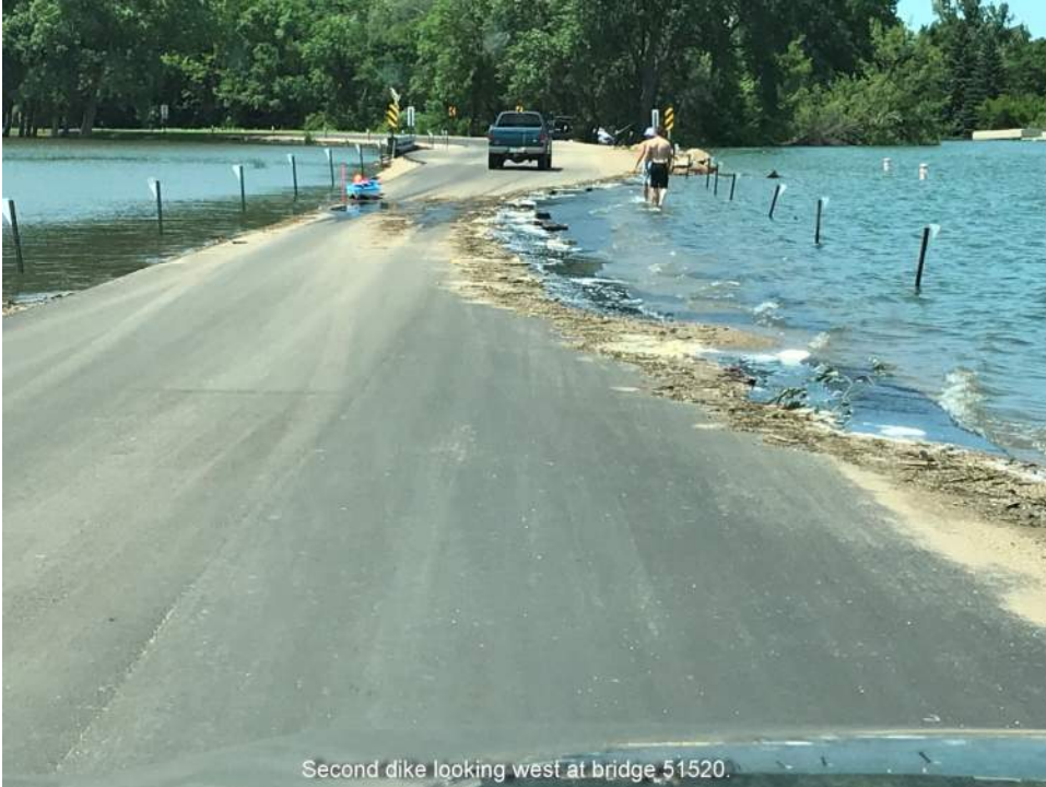
Second dike looking west at bridge 51520.