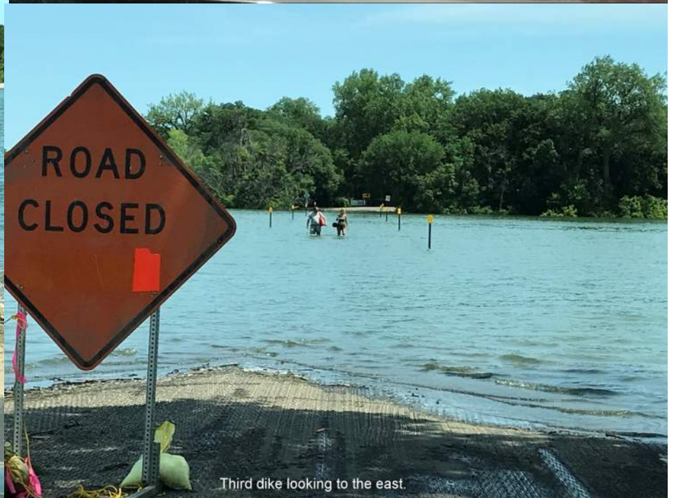
Third dike looking to the east.