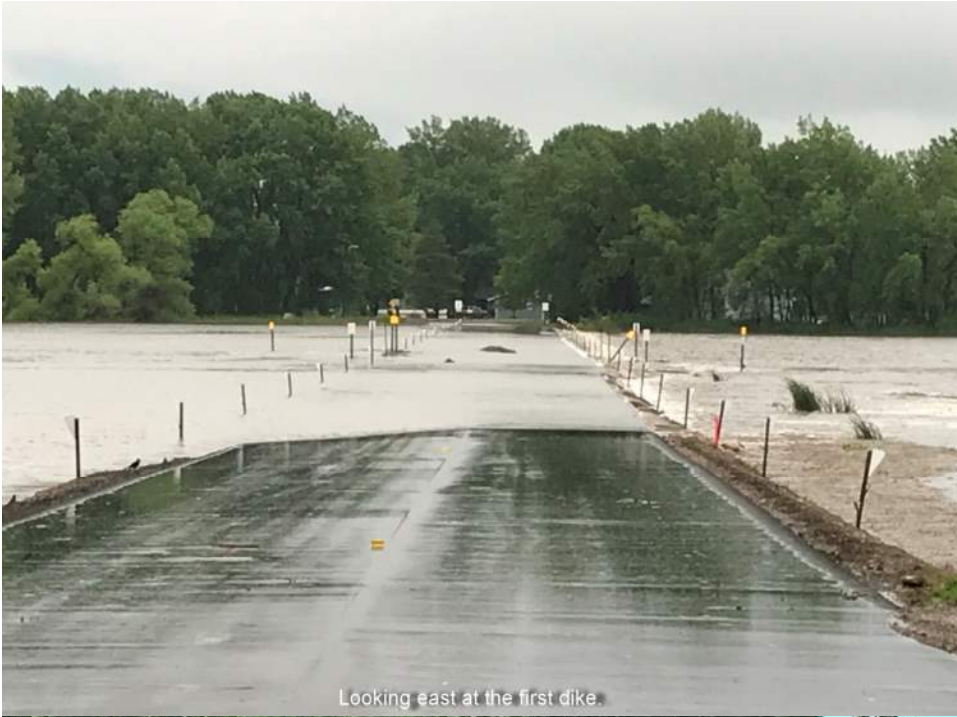
Looking east at the first dike.