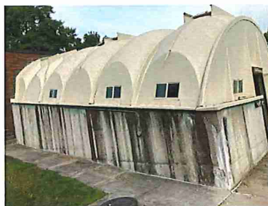
View of exterior of lower wet well end of lift station showing aging fiberglass cover. Concrete corrosion, cracking, and delamination areas visible on lower part of exterior wall faces, especially on northeast corner.