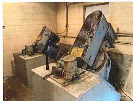
View interior of upper pump room showing motor drives for existing open screw pumps