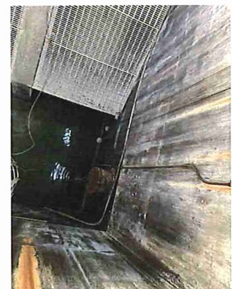
View looking down at corroded and inoperable overflow flap check valve on east side of lower wet well and corroded conduit.