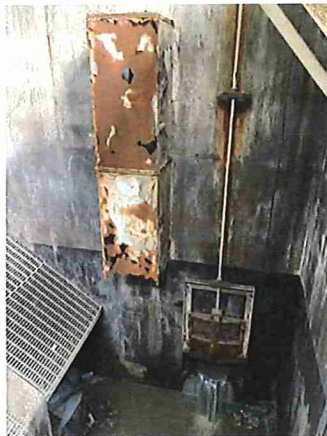
View looking inside the lower wet well area showing the corroded and non-operable influent slide gate and lower portion of the corroded ventilation duct on west side.