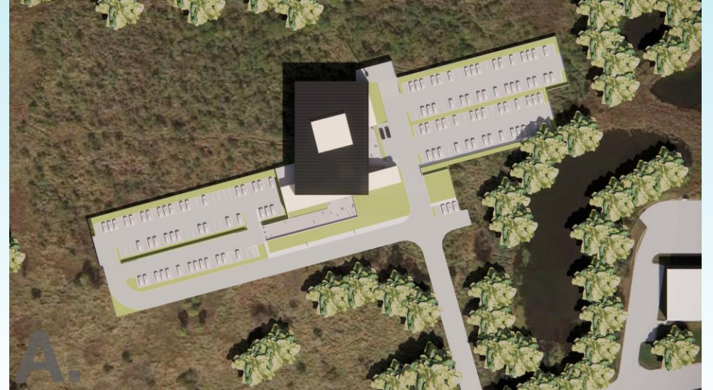
Design Rendering as of 12/2022