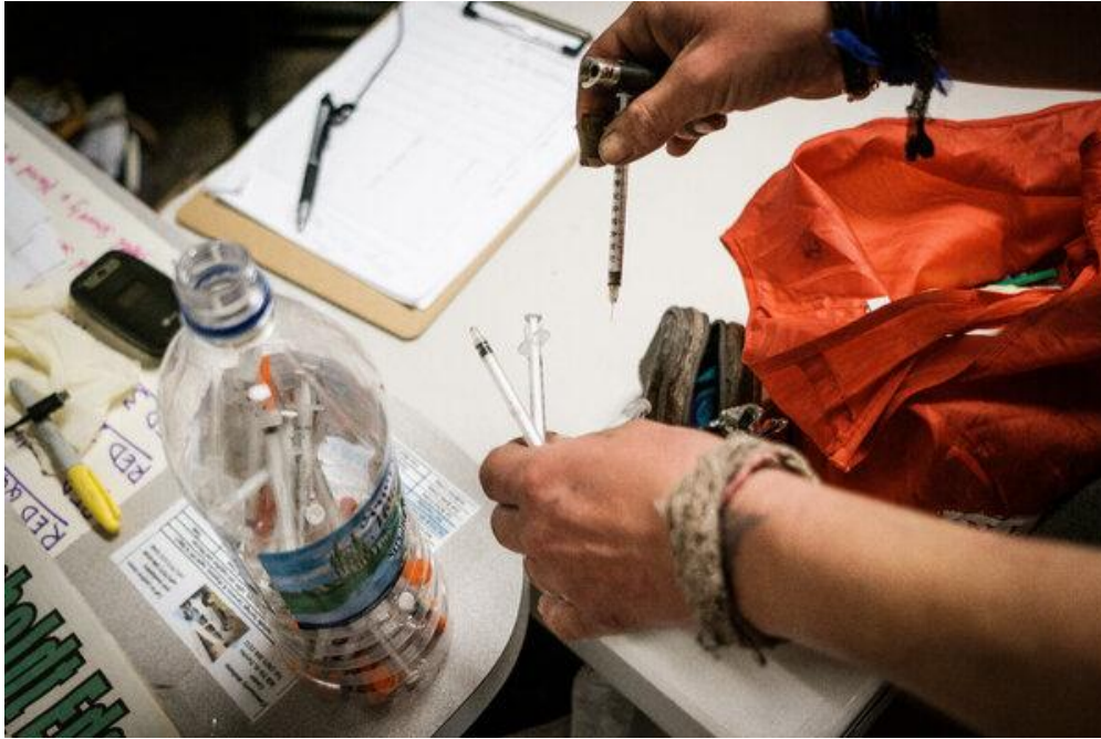
A needle exchange in Eureka, Calif.