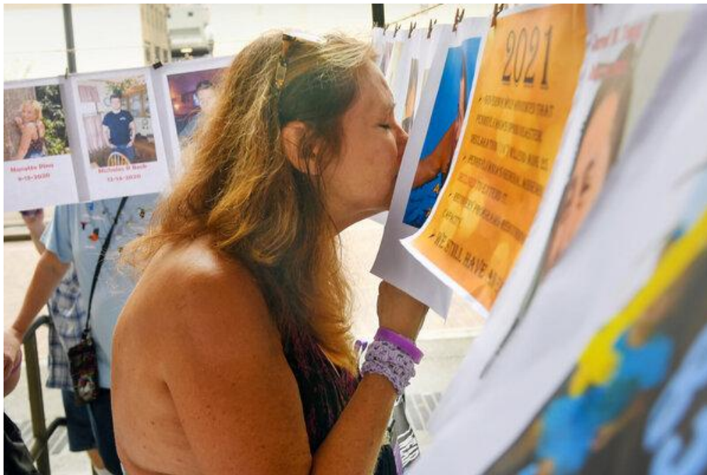
A service in Pittsburgh for people who died of drug overdoses.

Good morning. Overdoses are increasing at a troubling rate.